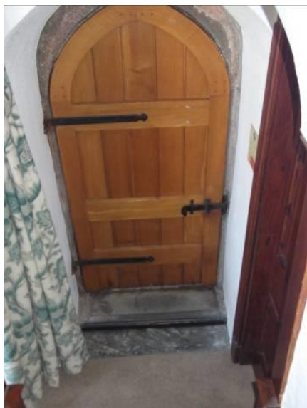
External door to terrace – ground floor landing.