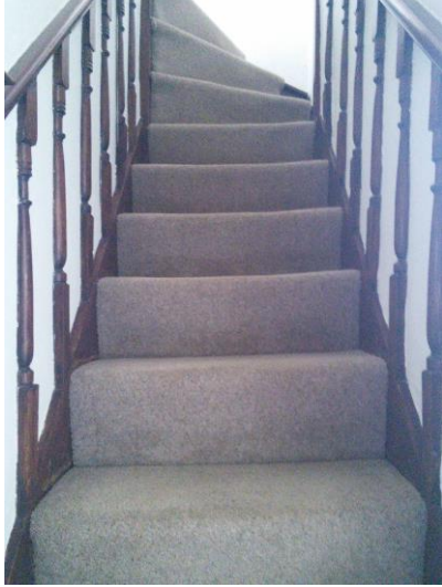
Stairs to bedroom