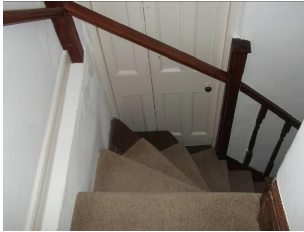
Looking downstairs from bedroom