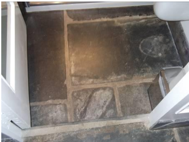
Step into shower room from door