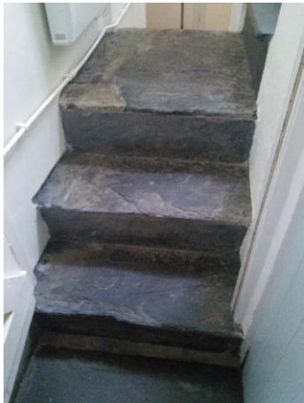
Steps up from kitchen