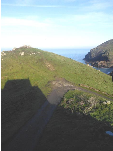
Last corner of track to Doyden Castle.