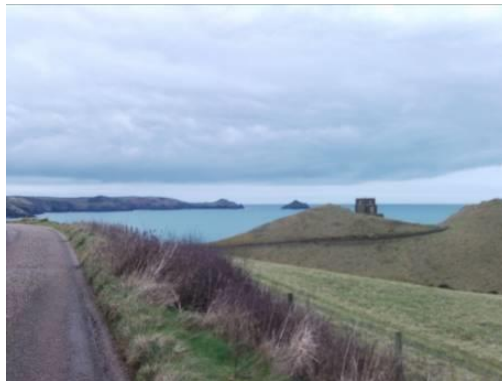
Track to Doyden House. Castle is in the distance