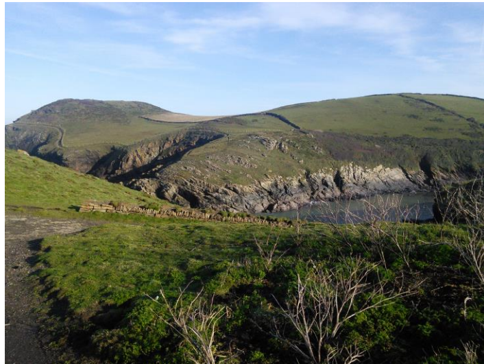
View looking away from a corner of the track