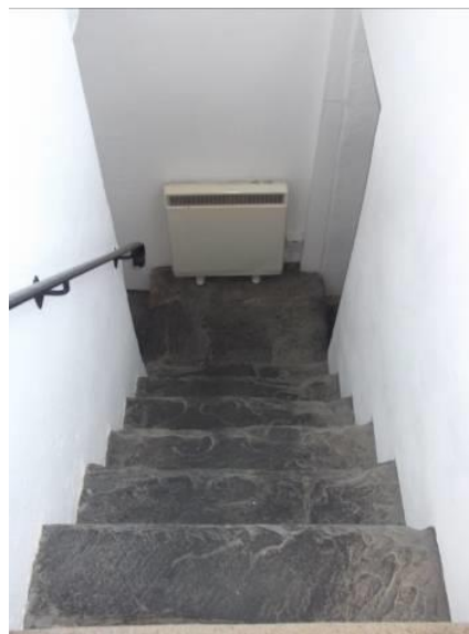
Looking down first staircase.