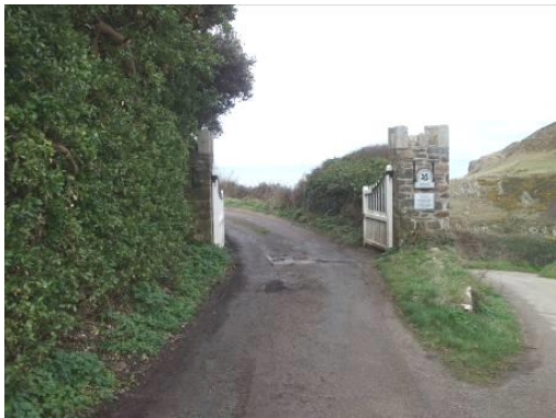
Doyden House Entrance