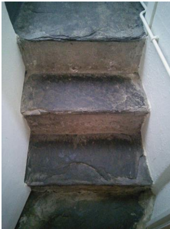
Steps down to WC