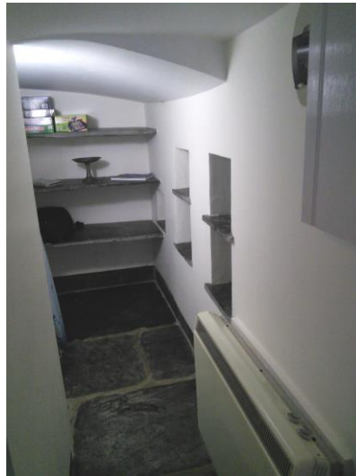
Slate shelved storeroom