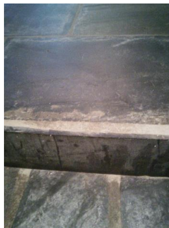
View of step from shower cubicle.