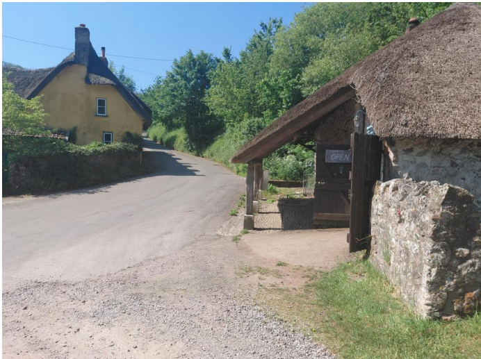
View from car park up the road towards the cottage