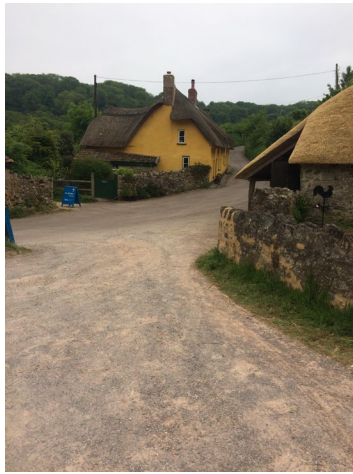
View of the cottages from the parking area