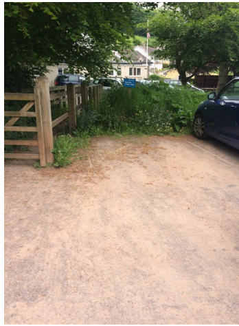
Dedicated parking area