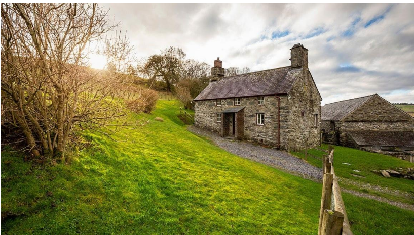
View of Parking in front of the cottage