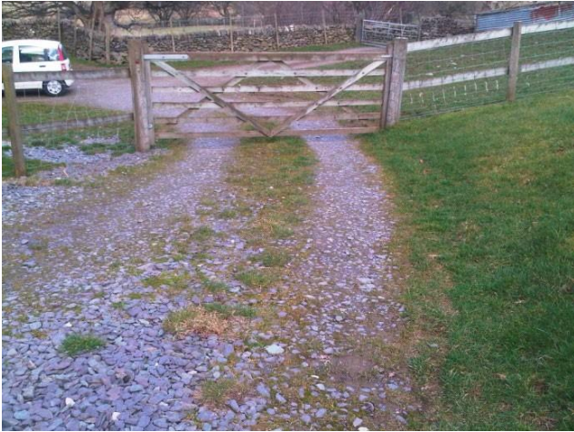
Part of Access track