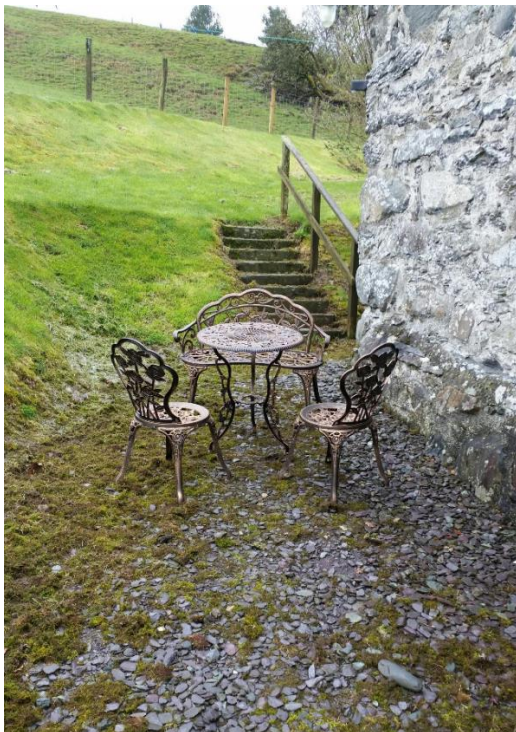
Seating in the garden