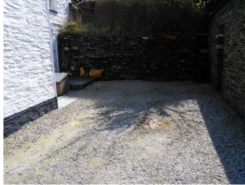
Parking spaces at rear of Harbour View