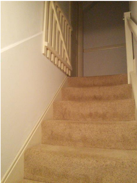
Looking up stairs to landing