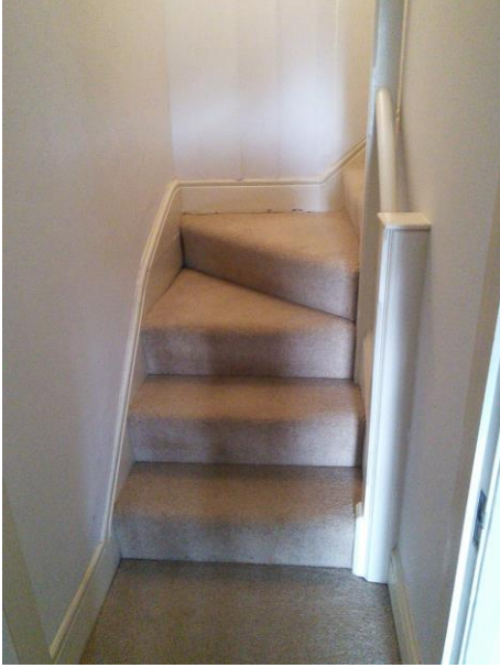
Bottom of stairs