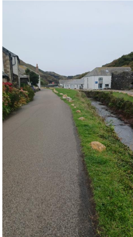
Private Road showing open riverbank