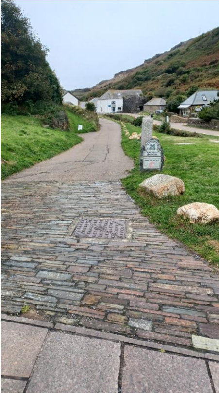
Private road off main road