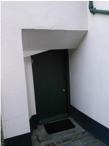
Back door with low headroom