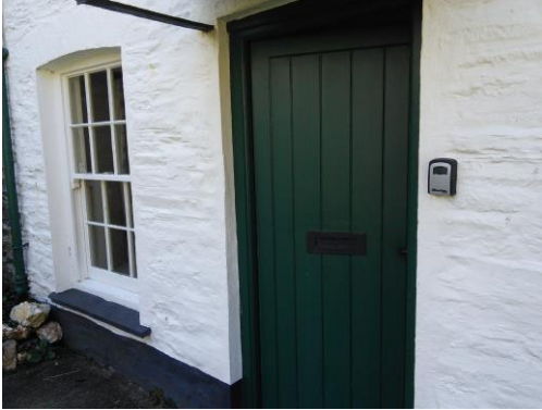
Front door showing key safe