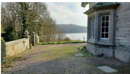
View from the parking area at the side of Helston Lodge looking across Loe Pool

The cottage is reached via a track marked private which runs through the Penrose estate. There is a gate which is sometimes locked but guests are given the padlock code in advance. The track runs alongside the walled garden of the estate to a T junction where you turn left and follow the road around and right to the other side of the lake. Helston Lodge is just around the bend facing directly on to the water. There is plenty of parking space to the side and rear of the house.