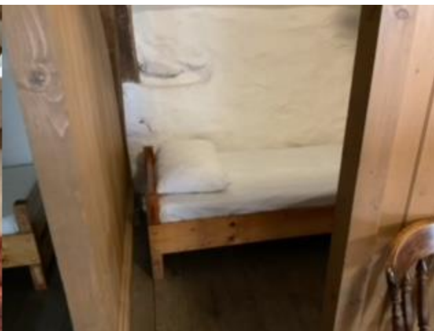
Single beds in partitions