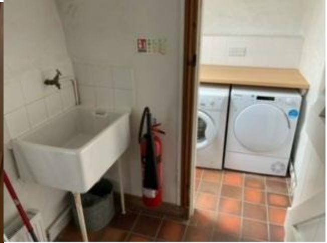
Ground floor Washer, Dryer, Butler's sink