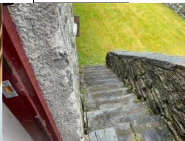
Upstairs outside fire escape