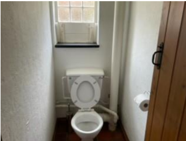
Downstairs washroom toilets