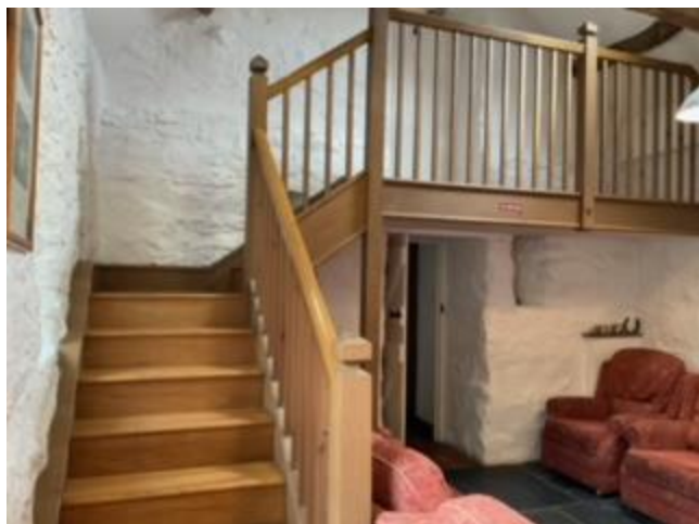
Stairs to First floor