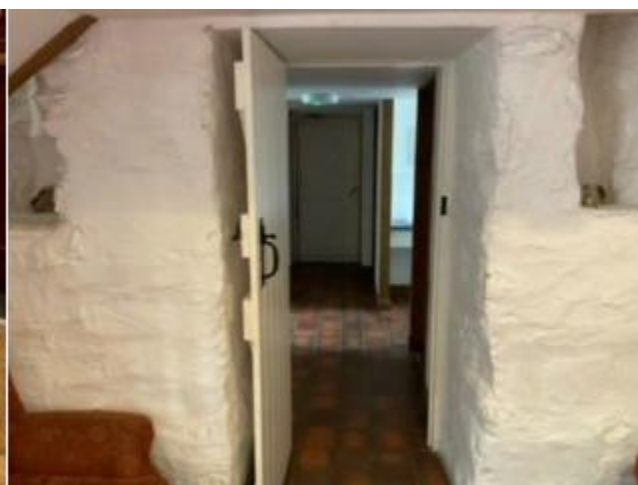
Access to downstairs washrooms and Dorm