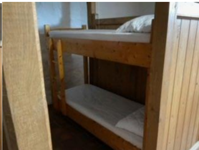
Downstairs Dorm Bunk Beds