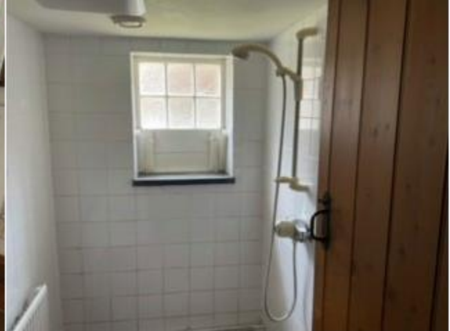
Downstairs washrooms showers