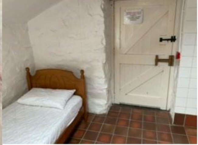
Lower Ground floor fire escape