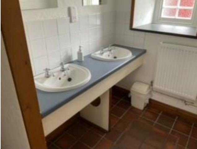
Downstairs washroom sinks