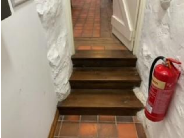
Lower ground floor access.