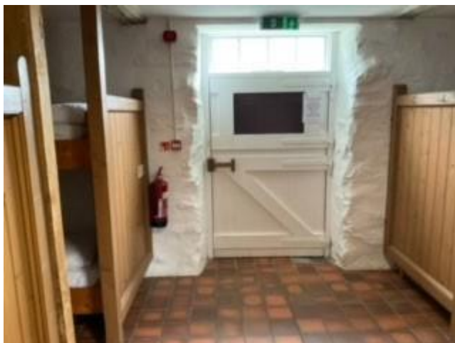
Downstairs Dorm Fire Exit