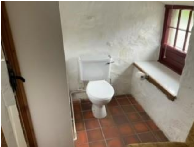
Lower Ground Floor toilet.