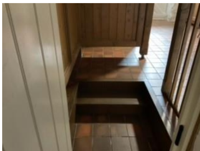
Access to Ground Floor Sleeping