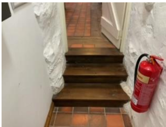
Access to lower ground floor