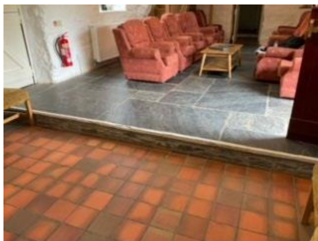
Main Seating Area