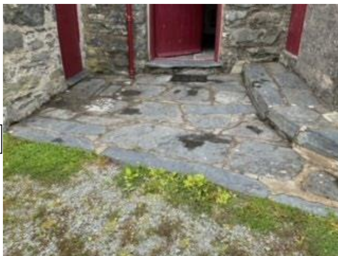
Steps to entrance