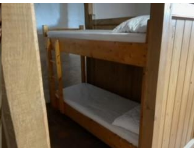
Ground floor bunk beds