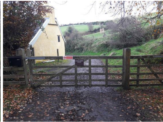
Gate to open