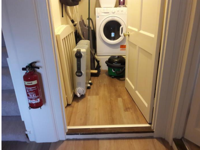
Small step of 70mm