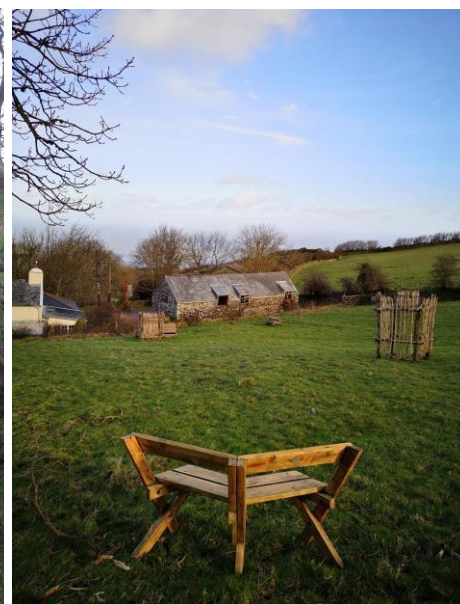
Seating with view