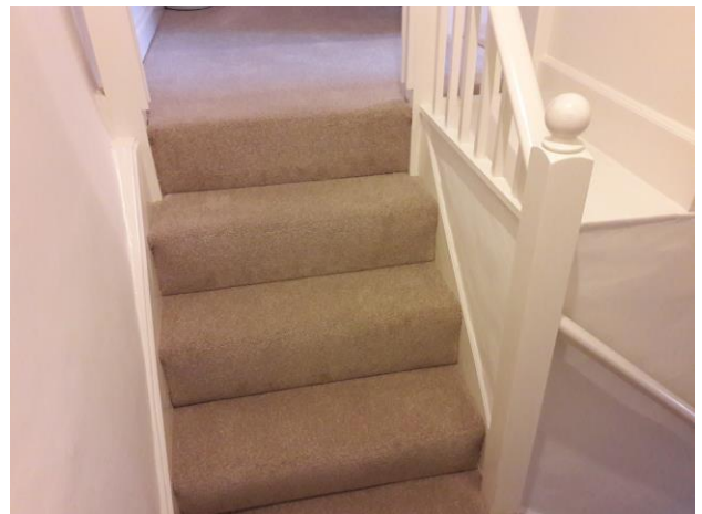
Upper set of stairs