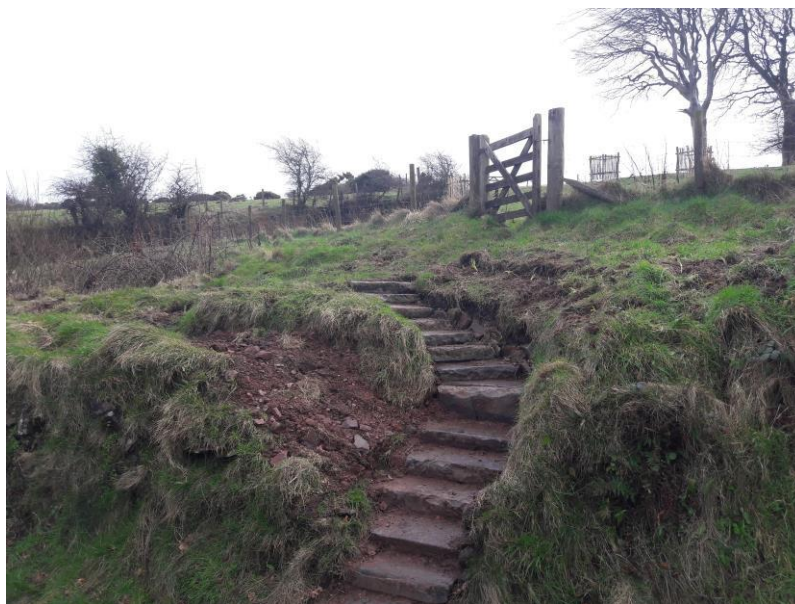
Steps to gate and then to the field