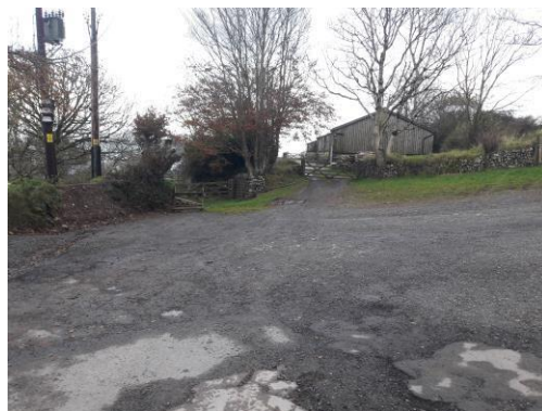
Parking on hard standing