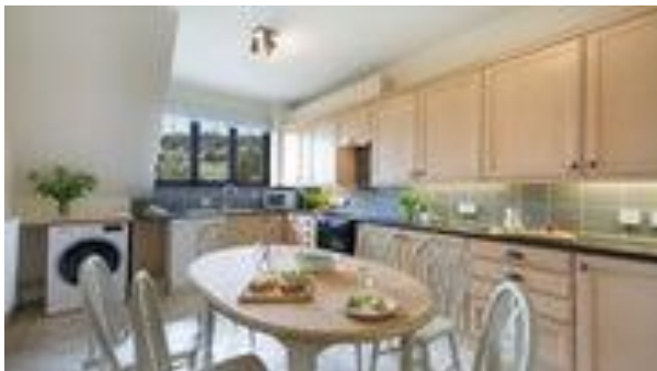
Kitchen/diner – doorway to living room on left