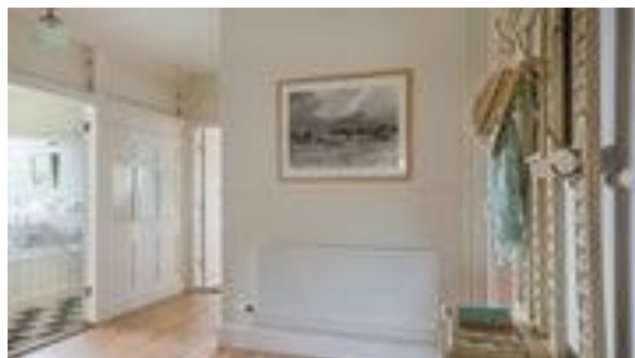
Entrance hallway with door to bathroom and living room