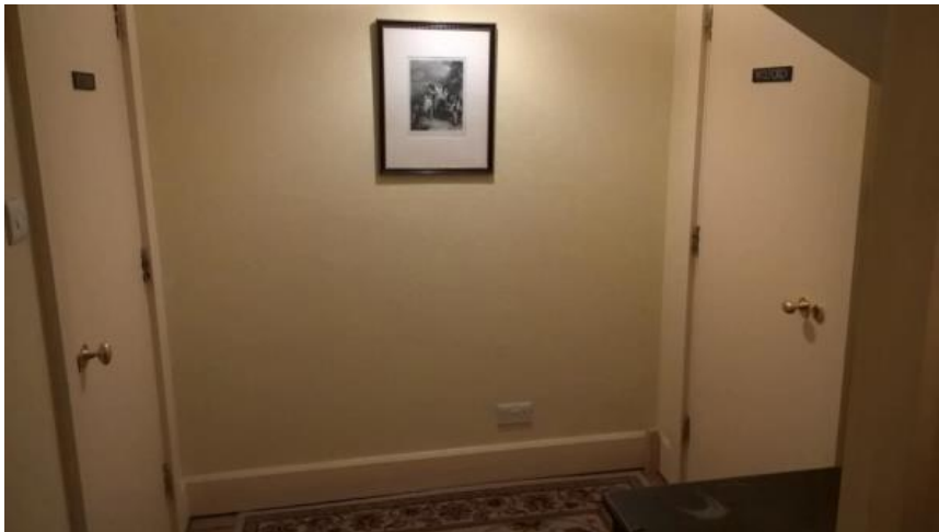
Main entrance to Kyson (on left) from second-floor lobby