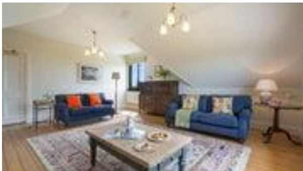
Living room with door to hall - sloped ceiling