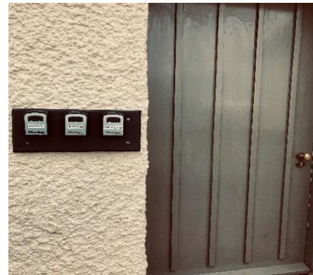
Keysafes at entrance to communal lobby