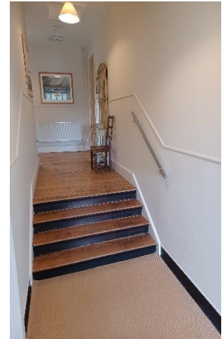
Lower hallway steps