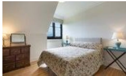
Double bedroom with sloping roof