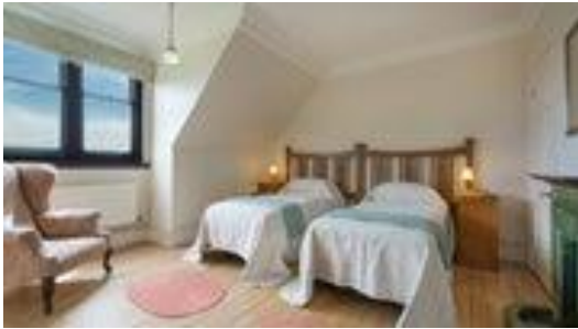
Bedroom sloping roof can be seen to the right of the window