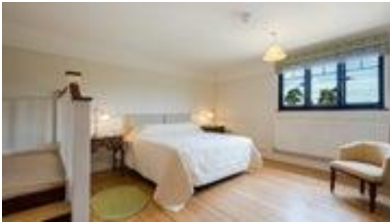
Super King or Twin Bedroom