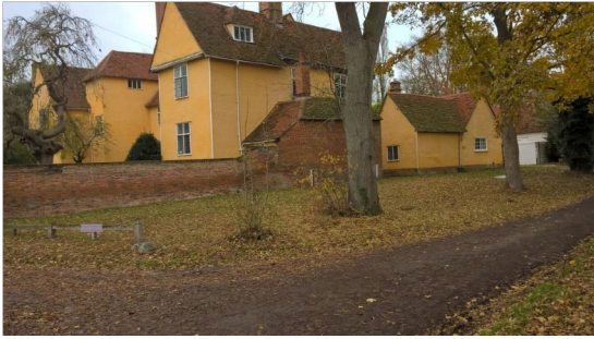
Thorington Hall from the junction of the main road and the side lane