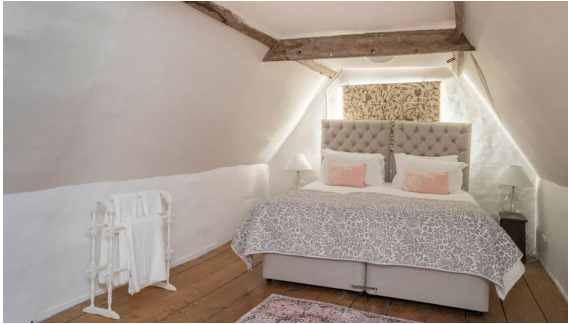
Bedroom 7 (May room)