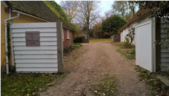
Outer entrance gates to gravel drive