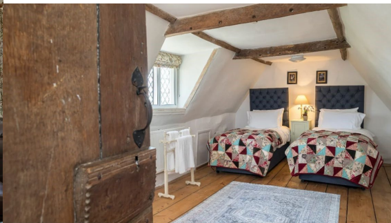
Bedroom 6 (Wade room)