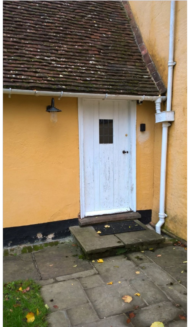
Front door with steps up and keysafe to right