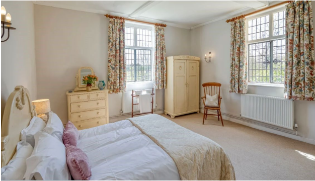
Bedroom 1 – Rosier room (above) Bedroom 1 ensuite (right)