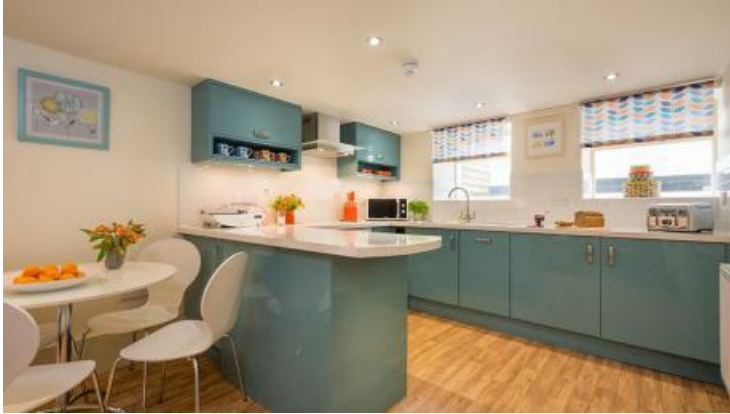
View of Kitchen from sitting room.