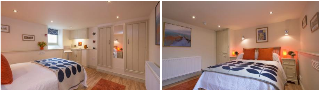
View of Double Bedroom