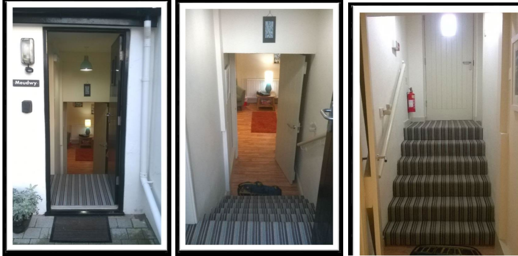
View of front door and stairs to lower level