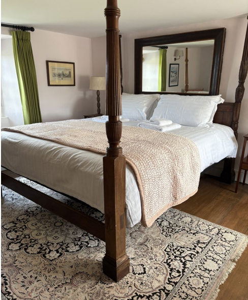
Bedside tables x 2 height 75cm