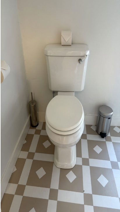
Wash basin height 84cm Single twist taps