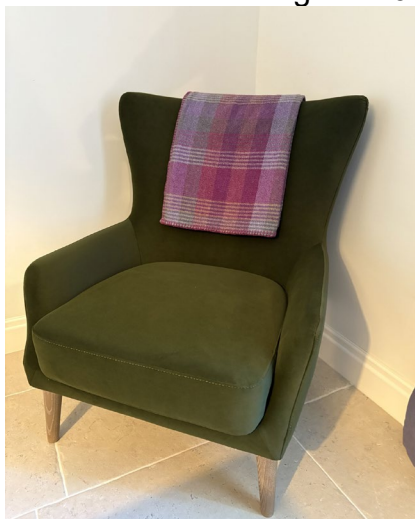
Quarry tile flagged floor