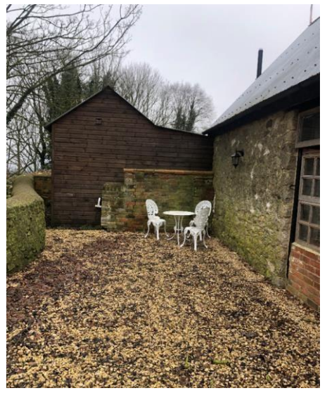
Rear seating area

- Assistance dogs are welcome at all our cottages