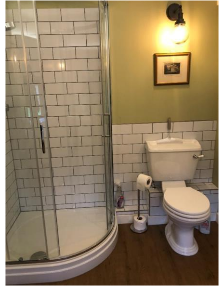
Toilet and shower