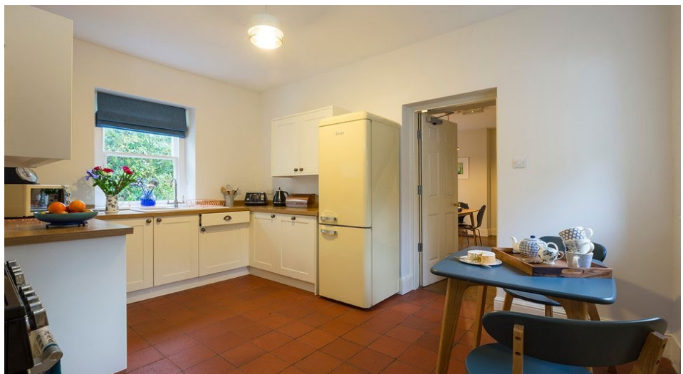
Kitchen, breakfast area and dining room through door