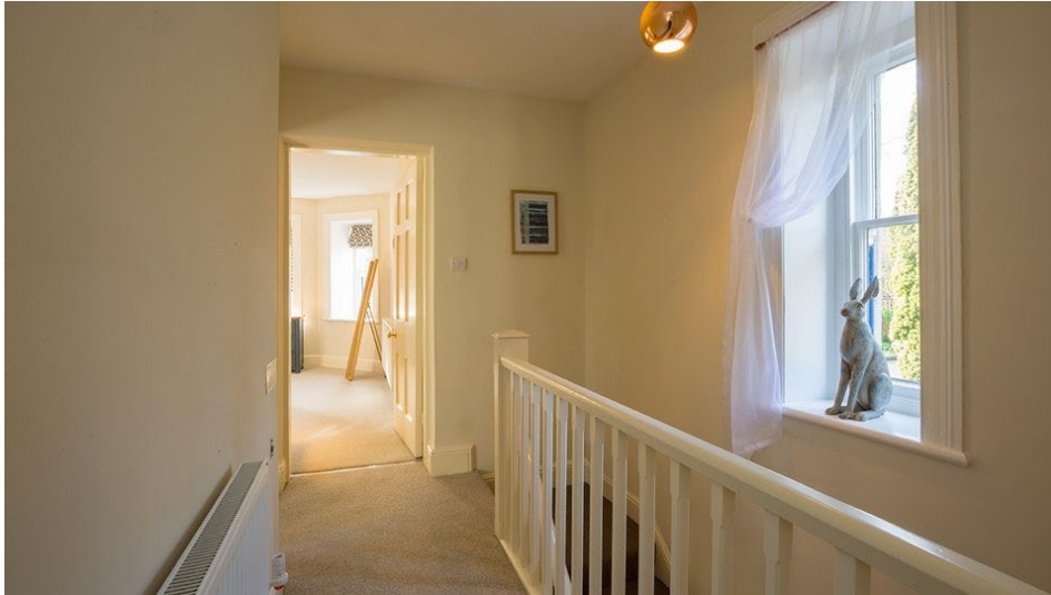
Top of staircase showing door to Master bedroom