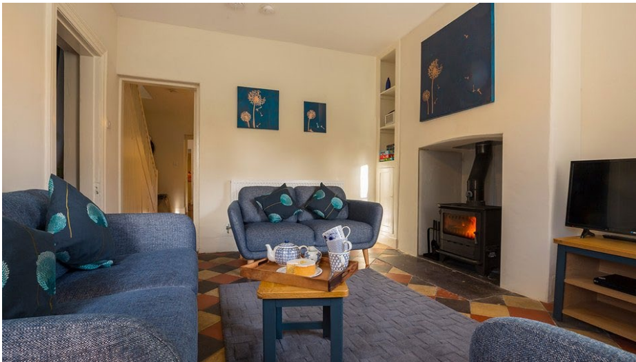
Sitting room showing door to porch and further door into dining room with stairway.