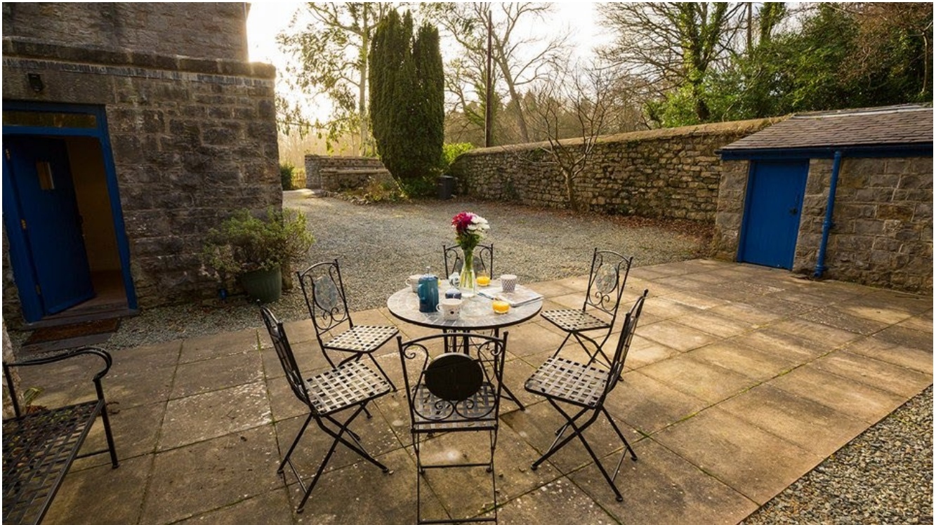
Garden patio area showing back door-main entrance