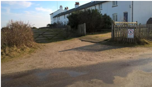
Entrance gate for vehicular loading area