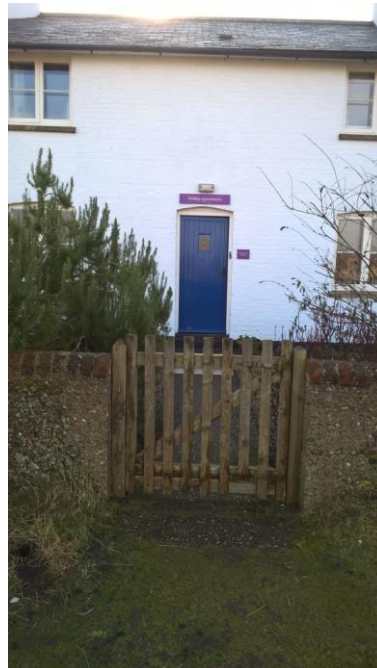
Gate from track to front door