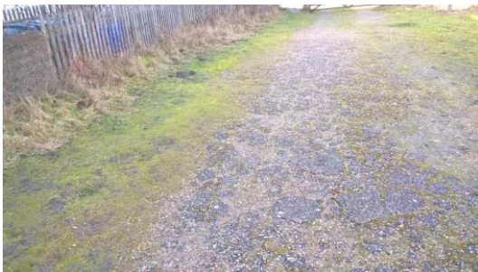
Entrance track from tarmacked road