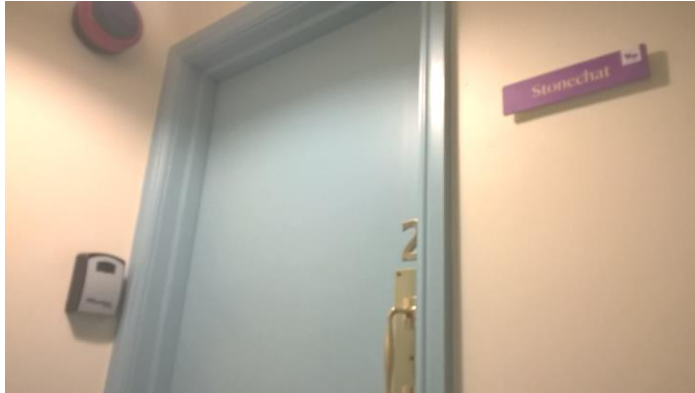
Entrance to Stonechat with keysafe to left of door