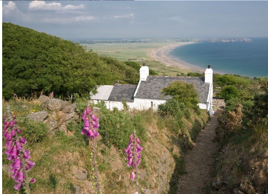
Access steps leading to cottage from road and the front doorstep