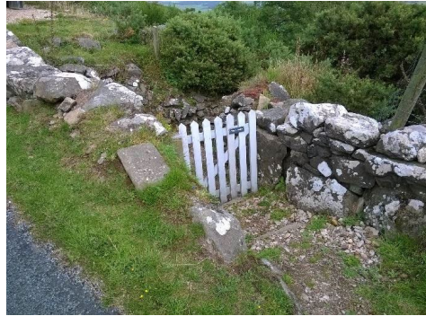
View of car parking area and gateway from the road leading to the cottage