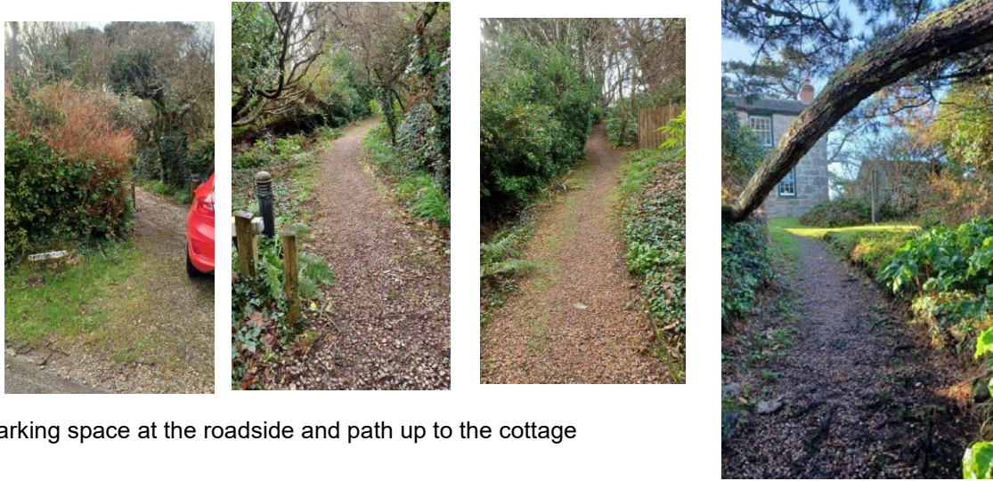
Parking space at the roadside and path up to the cottage