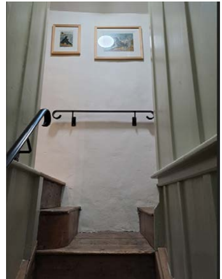
Left: From downstairs entrance hall up to bedroom and bathroom