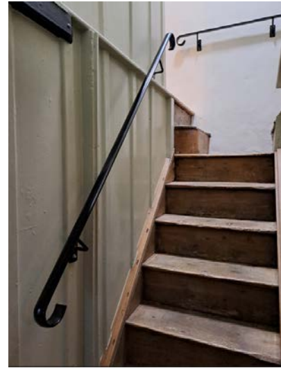
Right: Looking up the stairs towards the bathroom and bedroom