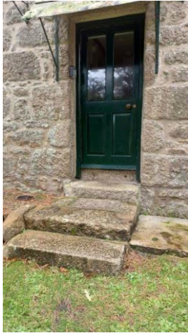
Left: Front door opens to hall with wooden staircase.