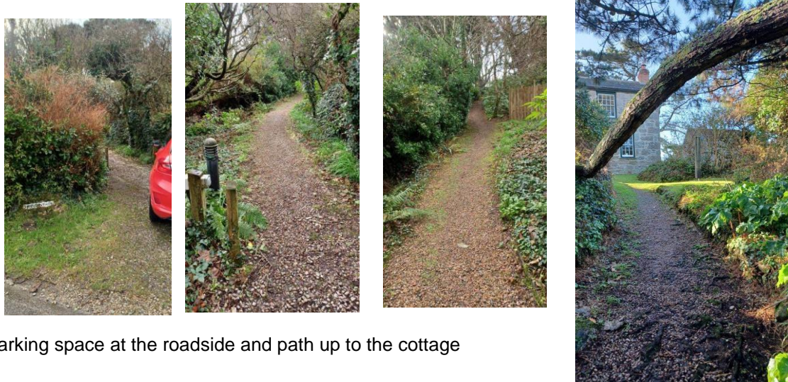
Parking space at the roadside and path up to the cottage