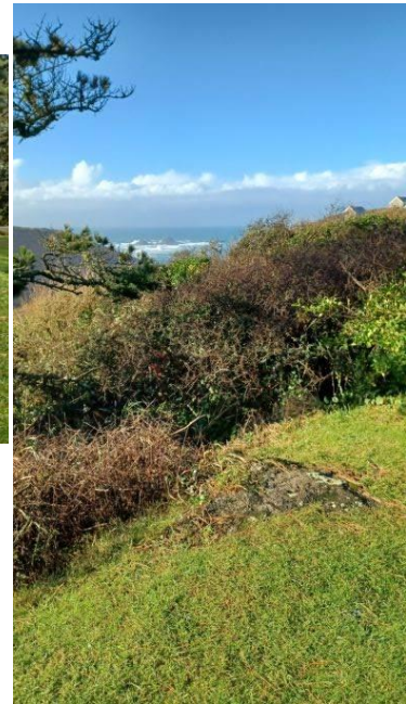
Left: side garden