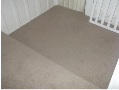
The landing is on two levels