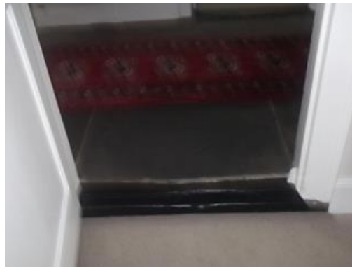
Step down to sitting room