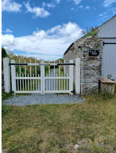
Gates to The Old Farmhouse