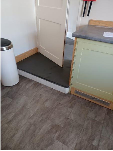
Step down from hall to kitchen