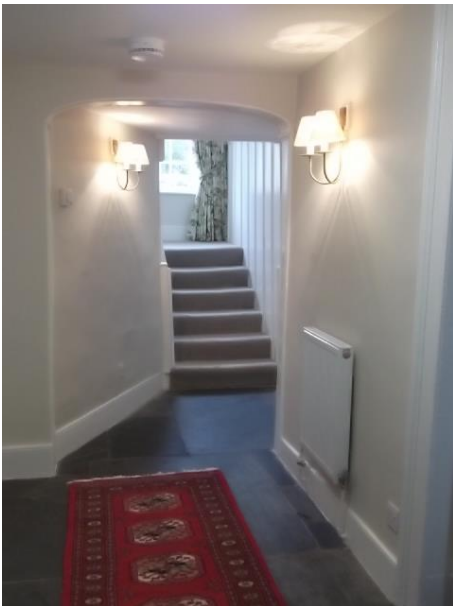
Hallway looking towards first flight of stairs