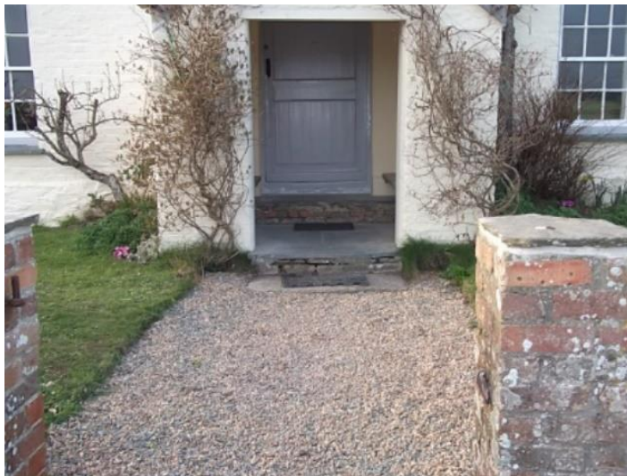
Path to Porch and front door