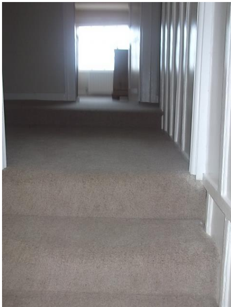
Top of stairs to landing