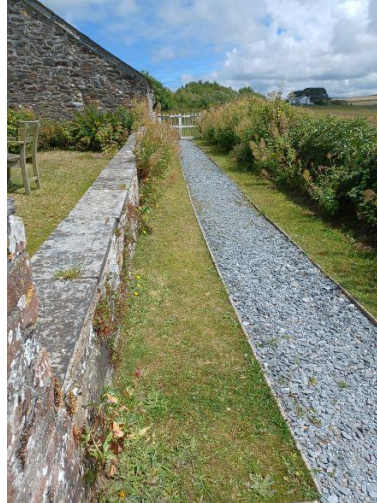
Path looking towards gate