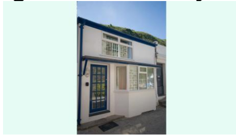
Tri-a-Hanner Porthdinllaen Morfa Nefyn North Wales Ref: 008024