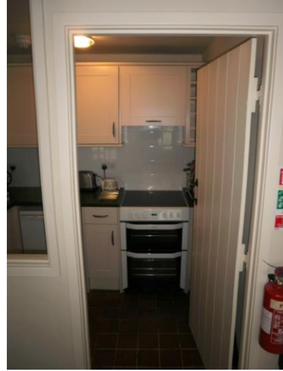
Flooring, stairs and kitchen door