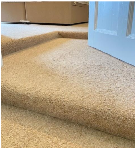
Step into Double Bedroom