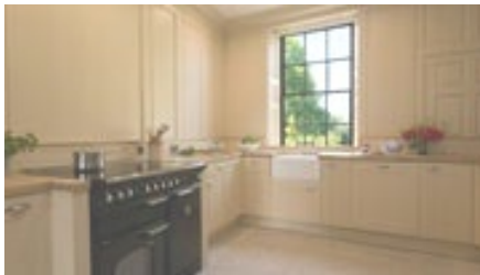
Kitchen – off main Entrance Hall

The light switch on the right of the door is a dimmer switch for recessed ceiling lights (press and hold for increased light levels). With vinyl flooring this is a spacious fully equipped fitted kitchen. Wooden work surfaces all round at a height of 914 mm. A large electric double oven induction hob range cooker 990 mm width height 914 mm, a white Butler style sink height 863 mm with bridged pillar taps, overlooking the back of property. One built in freezer and two side by side built in fridges (all these are under work surface height) above which is a glazed wall unit housing glassware and crockery. There is also a built-in dishwasher, a microwave, cordless kettle and toaster.