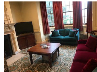
Sitting room - from Entrance Hall