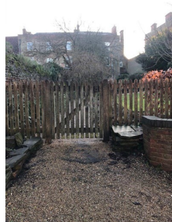
Wooden gate and hard surface path leading from courtyard parking