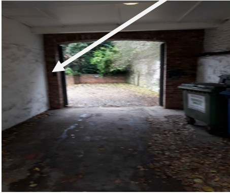
Within the archway off Chapel Road - with rear access keysafe location indicated