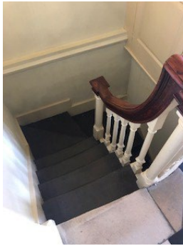
Wooden stairs to Basement