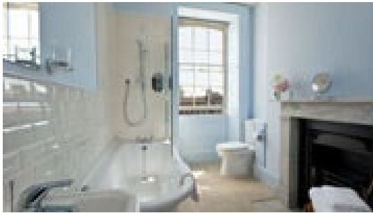
One of the 3 bathrooms (all similar)

Light switches are on the outside of all bathrooms beside the doors. All bathrooms have ventilation fans in ceilings. (extractor switches above doors – please do not turn these off.) Two bathrooms on first floor and front bathroom on second floor, all have baths heights at 584 – 596mm, with adjustable shower head facility over baths, glass screens from floor to top heights at 1930 – 1943mm. Chrome lever style mixer taps on baths and hand basins. All basins (heights at 774 – 838mm) have mirrors and lights above with the mirror height from floor to bottom of mirror at 1092 – 1270mm. Toilets have dual flush and are of lever handle mechanism, toilet seat height at 41mm, with soft close lids. Chrome heated towel rails in each bathroom at heights of 914 – 2171mm.