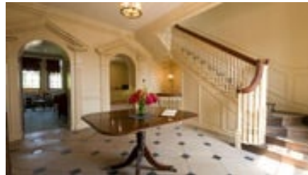
Front (main) Entrance Hall from North Brink