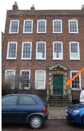
Parking and access via North Brink - front door entrance, key safe indicated

The front of the property has black iron railings with gate, immediately before Peckover House. 4 york stone steps height at 139mm by 762 depth, leading to a large brown front door (with brass numerals 14) door 1066 mm width and 2133 mm height. The key safes can be found to right of door at a height of 889mm (bottom of key safe)