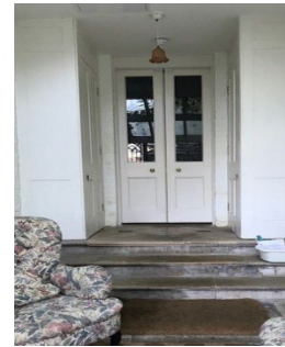
Conservatory steps up to the dining room entrance doors