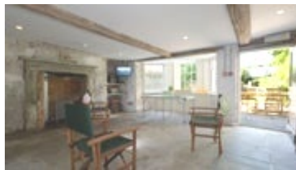
Basement games room – door to garden