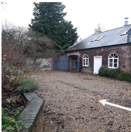
Parking spaces marked by wooden timber edging Double entrance doors open in background

The doors in this property range from 533 mm width and 2209 mm height. The light switch heights range from 939 mm to 1447 mm. Some in main communal areas are dimmable lights on a rocker switch – hold down for increased illumination.