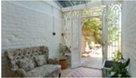
Conservatory rear entrance has double doors

Entering the conservatory, the light switch on your right is for the outside light. From the conservatory, 3 stone steps rise 165mm depth 266mm, leading onto the dining room and ground floor rear entrance. The light switch for the conservatory can be found on the wall to the left just inside the dining room. Openings from the entrance hall will lead you to the sitting room, kitchen and basement stairs and upper floor staircase.