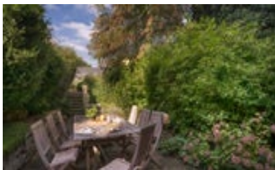
Lower terrace area from Basement door from Path to

The garden is on two levels with steep drops, so children should be supervised. 6 stone steps at tread depths of 139 - 152 mm rise at 139 – 152mm lead from the hard surface path down to the basement door and lower terrace area, where the outdoor garden furniture is accessible.