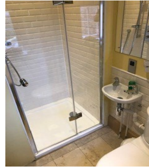
The shower room, second floor