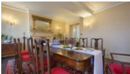
Dining room (showing doors to conservatory)

Entering the large dining room from the conservatory double doors at width of 914 mm (fully open) and 2209 mm height, it has a wood effect laminate floor covering with underfloor heating. The control panel for the heating is on the right of exit doors to conservatory at 1320 mm height. The large mahogany table at 711 mm height seats 12 people, there are 10 chairs and 2 carver chairs at 457 mm seat height with velvet coverings, table is seated on a large rug at 5mm thickness. The large fire place and mantel height at 1524mm houses a coal effect fire (not in use) and two free standing wooden serving tables that open out at heights between 732 - 744 mm, both with table lamps bulb height 508mm. Lighting in the dining room consists of 5 twin sets of wall lights which are controlled by a dimmer switch to the left of the door to the main entrance hall.