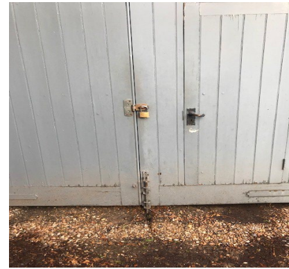
Inner courtyard - Personnel door and padlock (showing step through and padlock fastening)