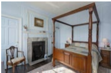
Front Master bedroom 1 – First floor

All bed mattress heights are between 660 – 685mm and beds are seated on rugs at thicknesses of 50 –127mm approx. Bedside table heights are between 711 – 774mm, with lamps, bulb heights between 381– 5mm approx.