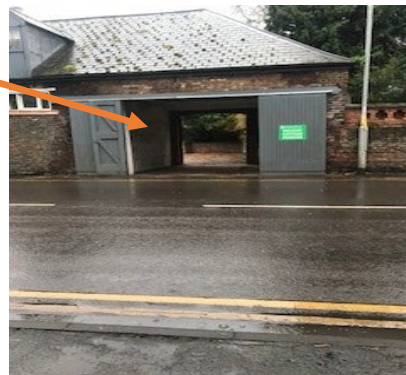
Access from Chapel Road at rear to private inner courtyard parking.