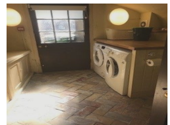
Basement cloak room (disused external door)