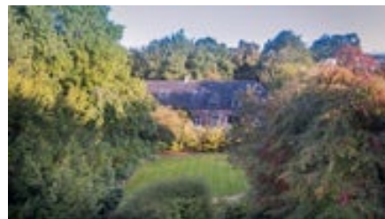
Steps to lower terrace area bedroom window.. Upper lawned garden courtyard parking and further 2 holiday cottages