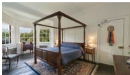
Rear Master bedroom 2 - First floor