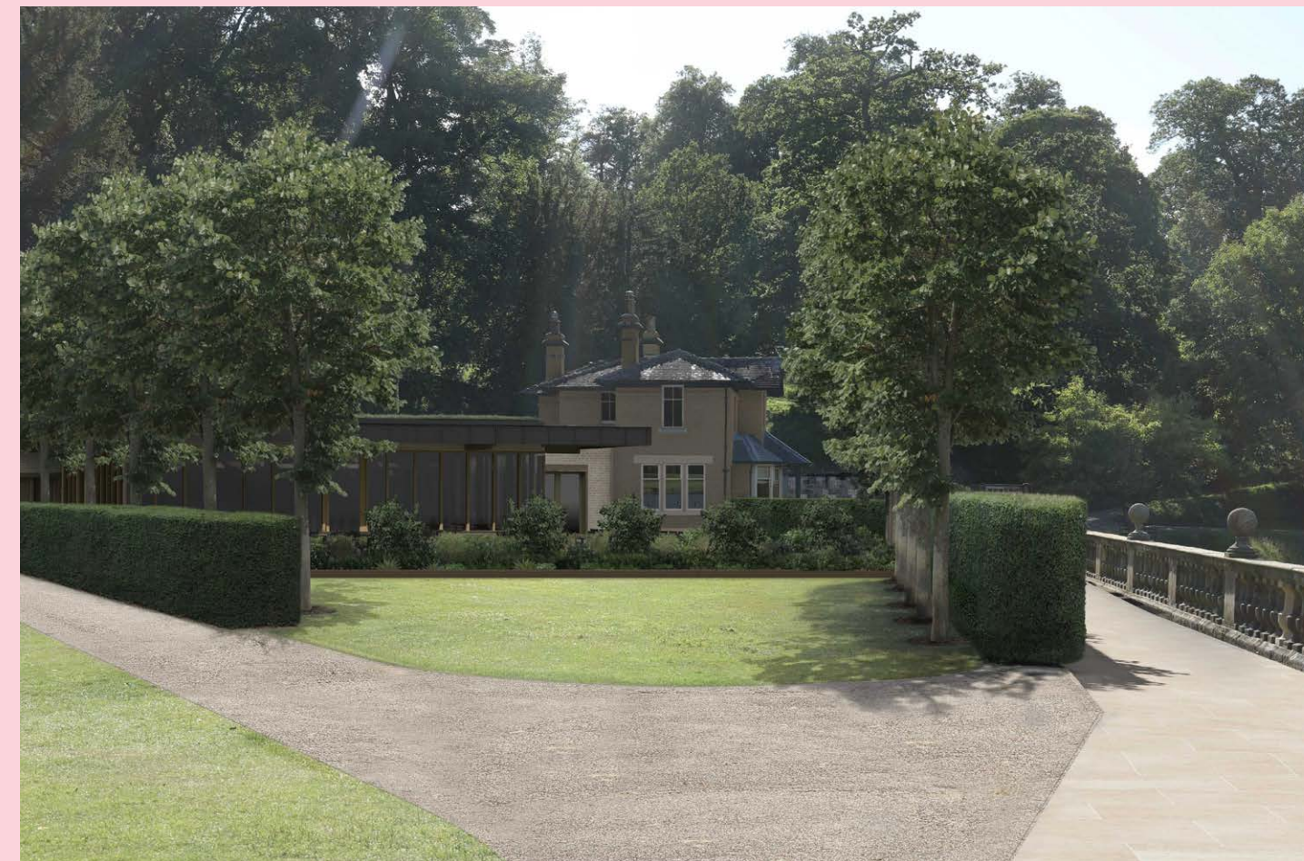
An illustration of the re-opened sightlines and planting towards the new Studley building.

The entrance here has often fallen short of visitor expectations, mainly because of the building's design and the position of the café behind the pay barrier. The remodelled building and extension feature an improved and more accessible welcome area for visitors, particularly important for the 80% of visitors who are halfway through their visit.