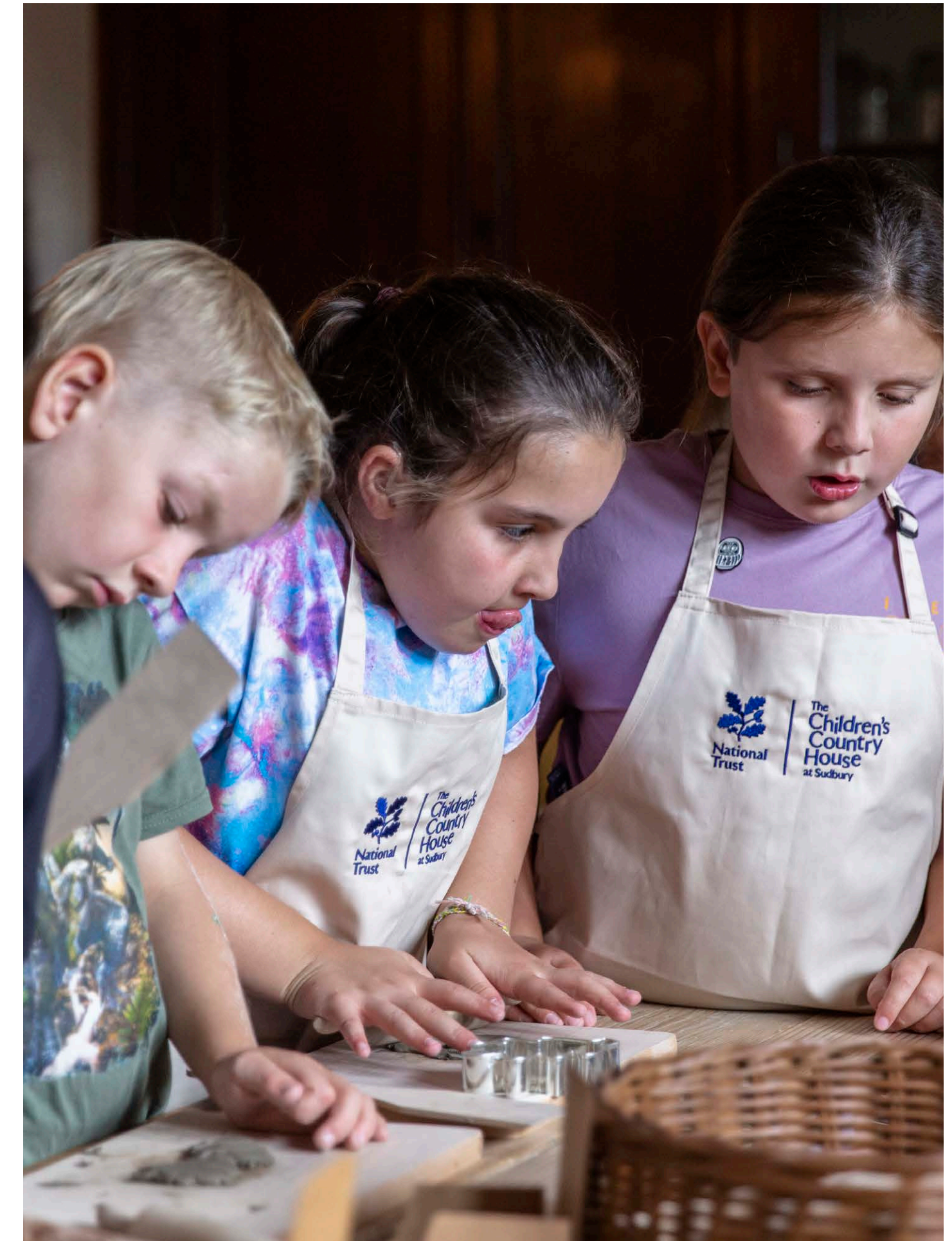
Clay crafting activity in the Kitchen at The Children's Country House at Sudbury, Derbyshire.

By embracing a flexible approach to conservation, we encourage exploration, while maintaining our core focus on carefully protecting our historically significant collection. This balance allows children to interact with the space in joyful, meaningful ways, bringing history to life through play.