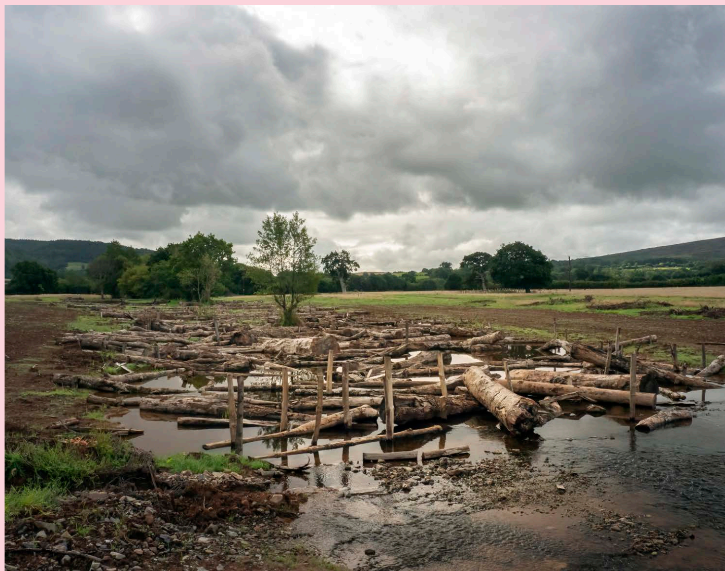
Holnicote River Project, Holnicote Estate, Devon.

Like many lowland rivers, the River Aller at Holnicote had been straightened, deepened and separated from its floodplain in all but the biggest floods. As a result, water rushed towards Allerford and Bossington, threatening houses with flooding, while wildlife struggled to gain a foothold in the fast-flowing stream.