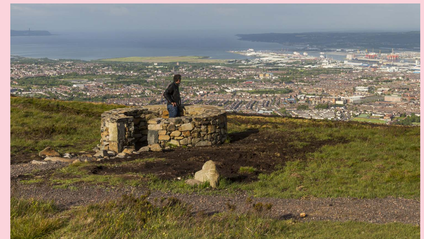
Views from Divis Mountain at Divis and the Black Mountain, Northern Ireland.