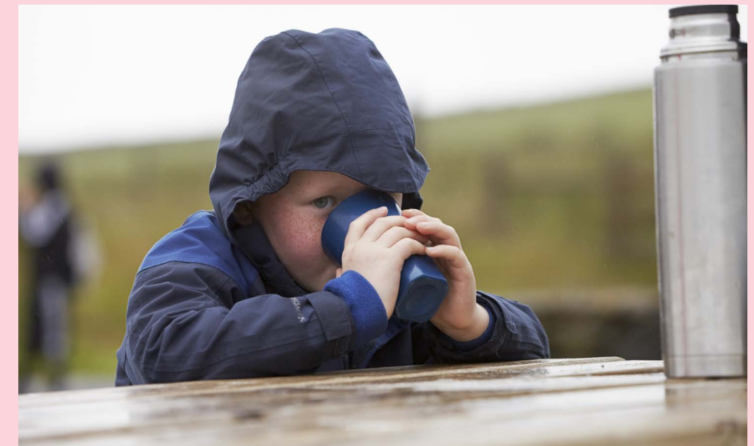
Child having a drink whilst on a walk at Divis, County Antrim, Northern Ireland.

Together with our community partners, our vision is to create one of the most accessible upland urban green spaces in these Isles, where people and nature thrive together in a healthy, wild landscape.