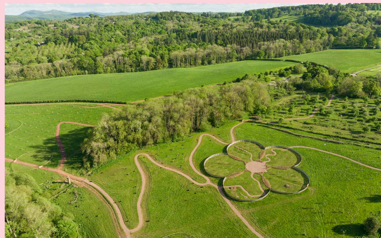
Aerial view of the renewed orchard at Brockhampton, Herefordshire.