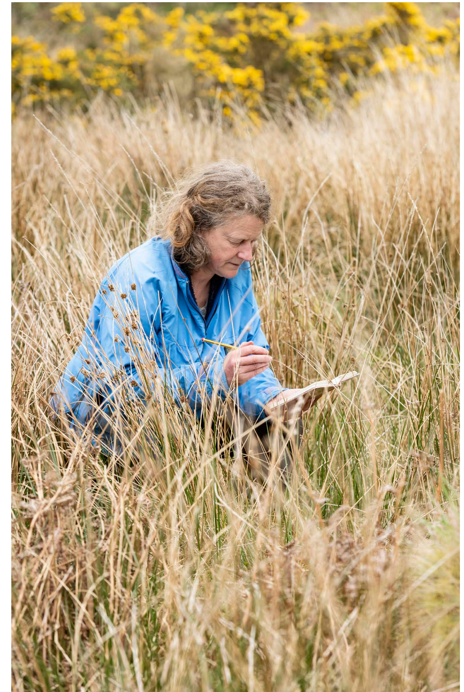
Ecologist at work during the first mass planting of marsh violets aiming to change the fortunes of rare butterfly species at The Hollies Nature Reserve, Shropshire Hills, Shropshire.

We recognise that some of the things we care for are fragile and finite, endangered and vulnerable, and so we consider our responsibility to future generations in how we care for and record cultural and natural assets. We also understand that our actions must be viable today and sustainable tomorrow – environmentally, socially and economically. Our choices are therefore proportionate. We recognise resource limitations and we future proof as far as possible, acting with pace and purpose to build resilience and adaptability.