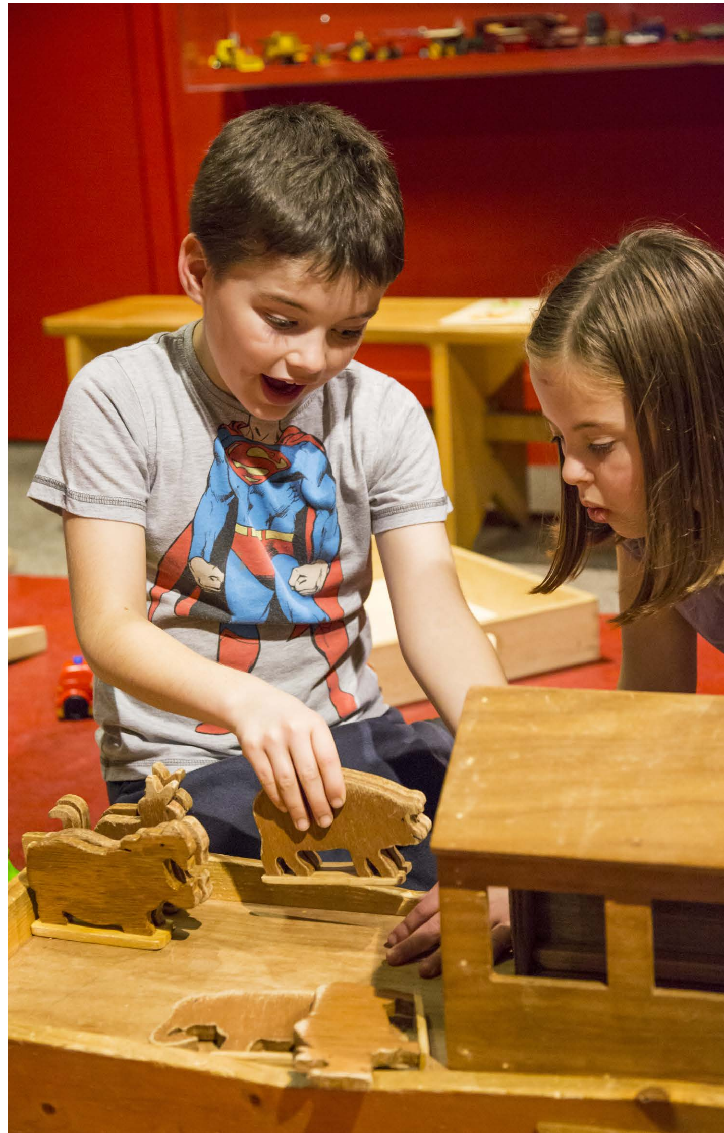
Playing in the activity area in The Children's Country House at Sudbury Hall, Derbyshire.