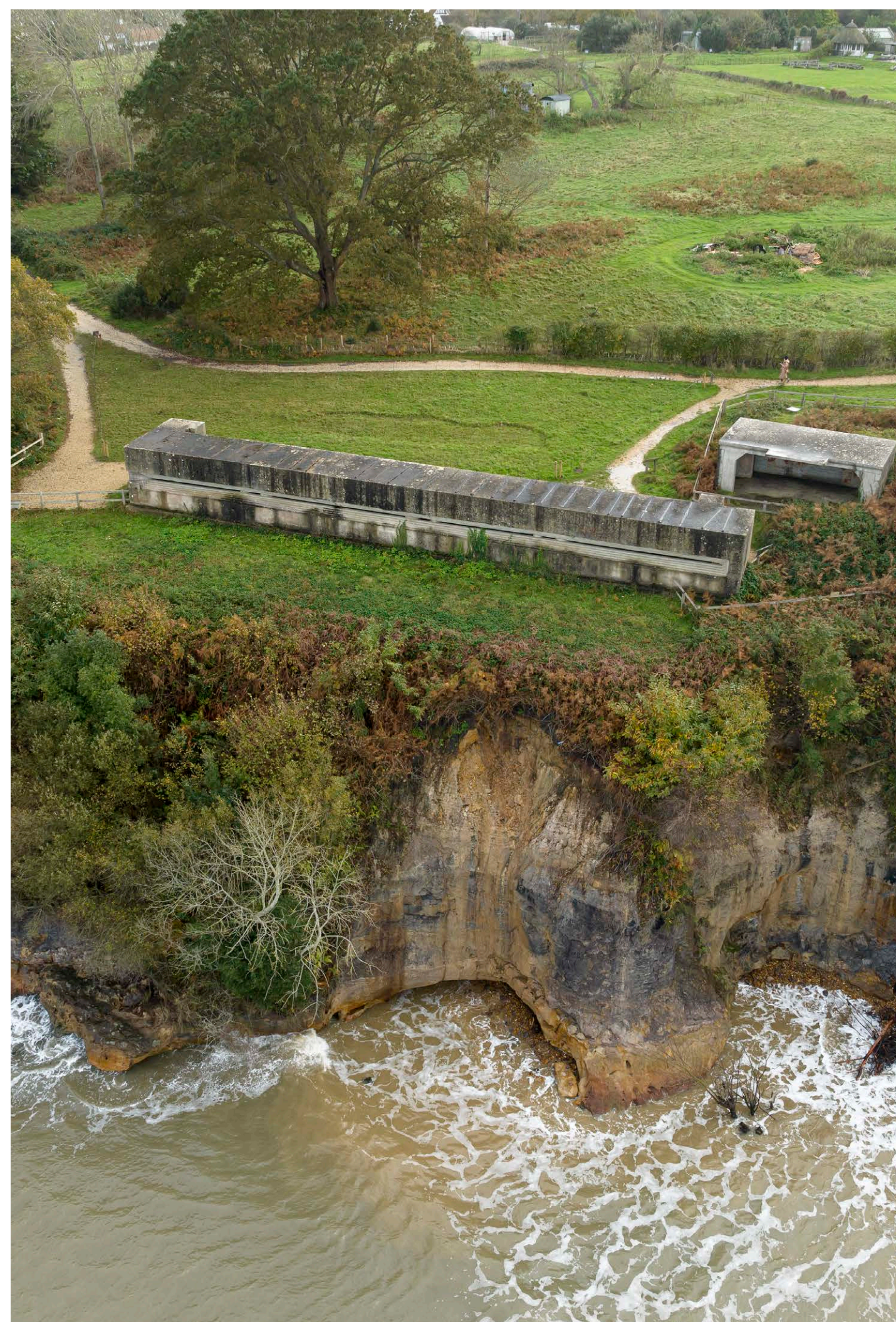
Fort Henry, only 4m from the cliff edge, Isle of Purbeck.

We embrace evolution where appropriate, recognising that new forms of significance and new values for nature and culture will emerge, and that change can bring new opportunities.