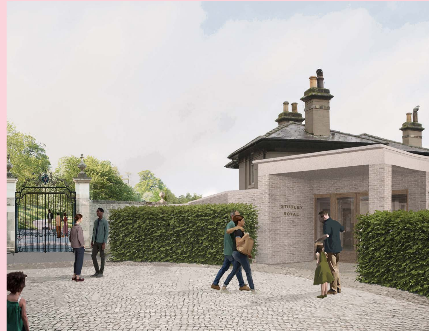
An illustration of the new entrance to the building from the water garden – Studley Revealed project.

The work has removed 20th-century interventions, more than doubled the footprint of the original building and crucially, now includes space to change. It's restored lost garden features and removed a temporary fence that fragmented views within the space. The project has also considered carbon footprint and includes a green roof and an air source heat pump.