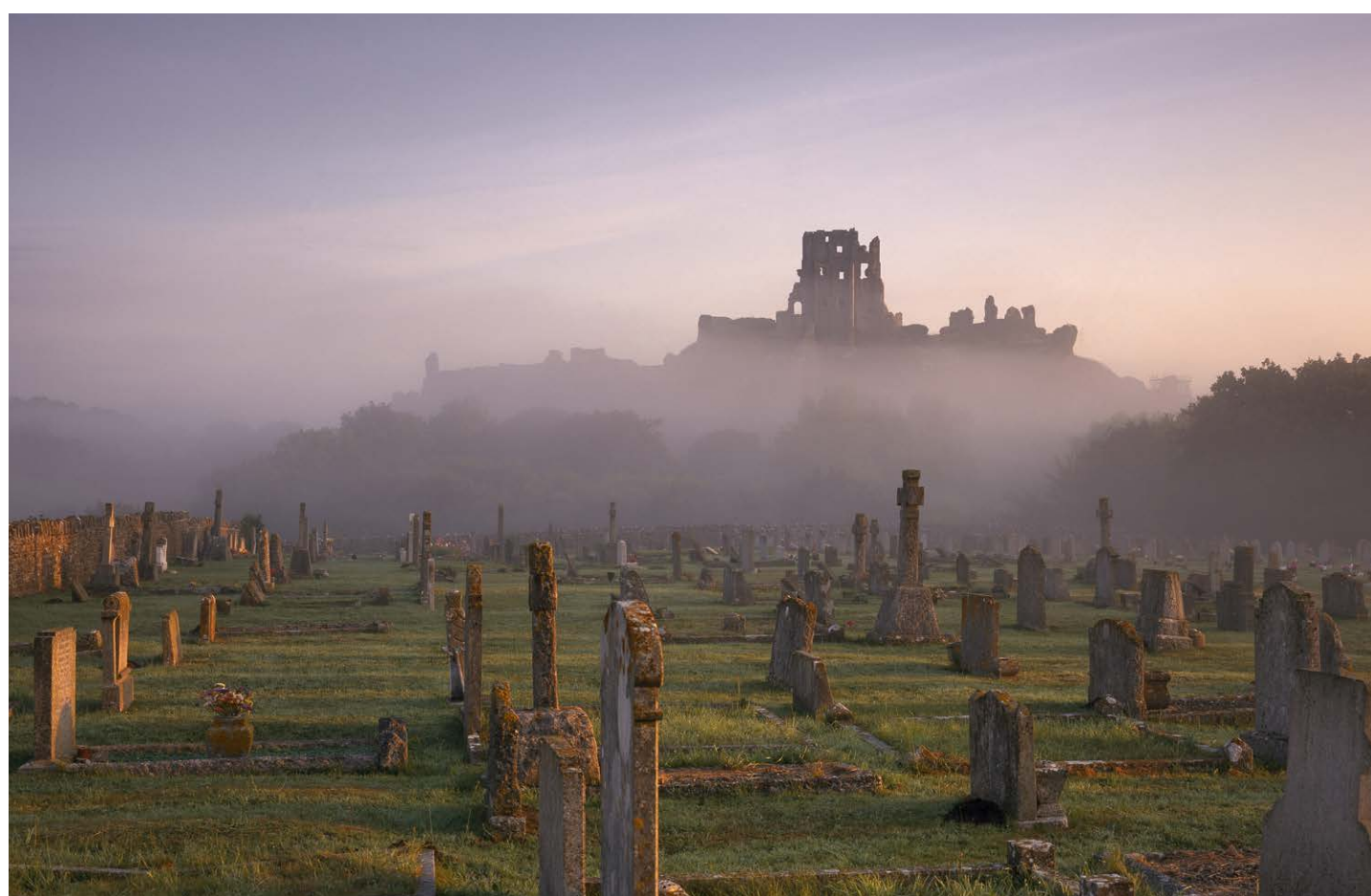
A view of the ruins of Corfe Castle surrounded by mist and in the low grounds are headstones from the nearby cemetery.

Conservation is collaborative. We take an integrated approach to conservation recognising that none of our assets exist in isolation but are all part of broader systems and places. We celebrate this connected world and recognise the contribution of individual man-made and natural assets to the beauty and function of individual places, regions, countries and global contexts. We therefore consider our choices in the context of their wider impact, and we work together to share the skills and expertise needed to care for multifaceted places.