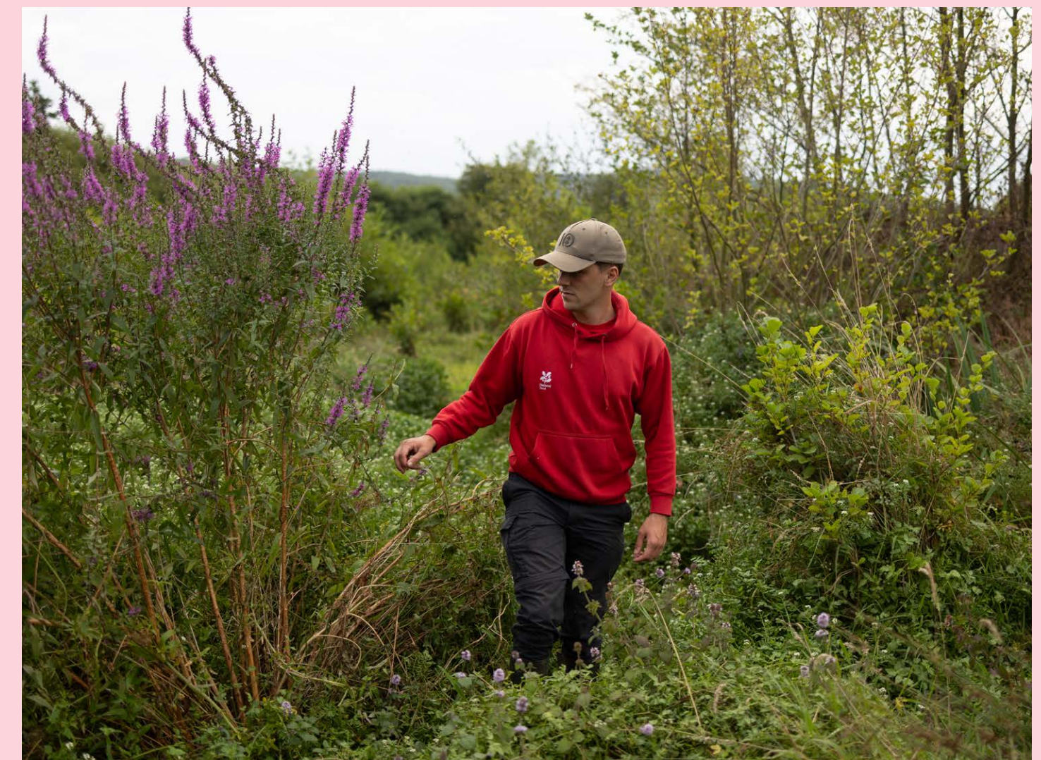
National Trust ranger monitoring the grounds at Holnicote Estate, Somerset one year on from the completion of the river restoration project.