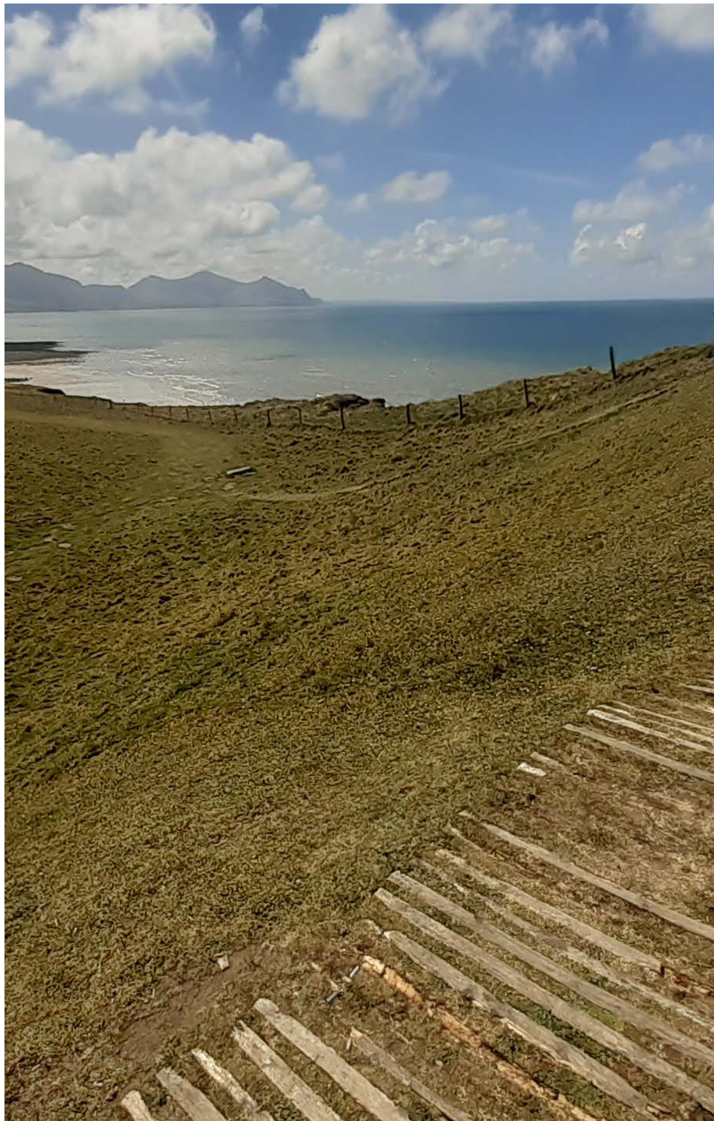
View from the ramparts looking out to Irish Sea from Dinas Dinlle.