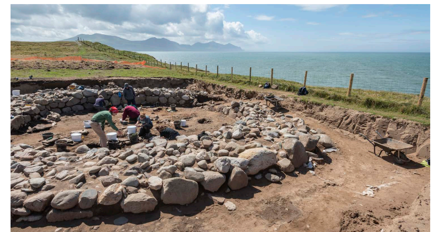
Local volunteers carrying out excavations on their local heritage at the Dinas Dinlle hillfort, Gwynedd.

new digital interpretation telling the story of the site from the Ice Age through to the Second World War. Instead of backfilling the site to preserve archaeological remains under the soil, our perspective has shifted to think about how our conservation work can benefit people today, ensuring they can experience the history here before it's lost, and so the site was consolidated and left exposed.