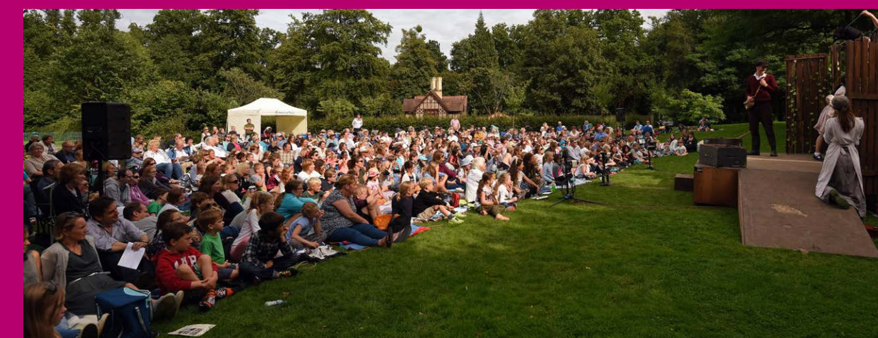
Live performance of The Secret Garden at Cliveden, Buckinghamshire.

Together, we prioritise conservation investment based on public value, recognising this will be different to different communities. We take equality of access and engagement seriously and prioritise opportunities to deliver both physical and intellectual access to our places. We encourage public participation in conservation activity where possible, recognising the well-being benefits this brings.