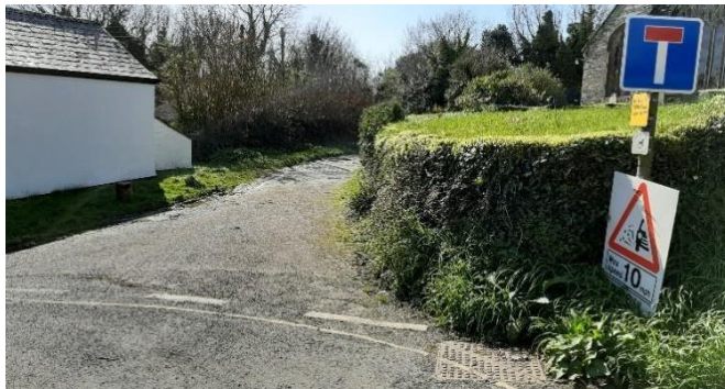
The start of the path to the beach next to the Church

The designated route is marked by pink arrows like the one on the post near the start of the path