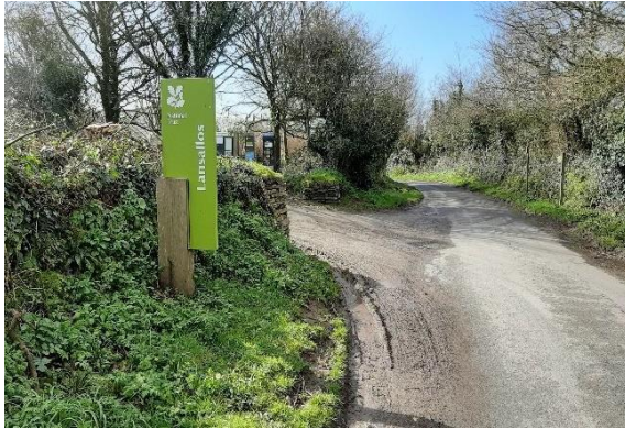
Car park entrance at Lansallos