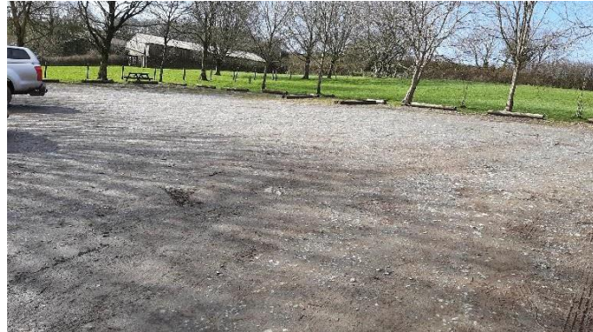
Compacted gravel surface of car park