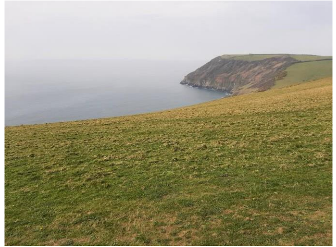
Left – looking towards Pencarrow Head and right the views west along the coast. All this is just a short stroll from the car park