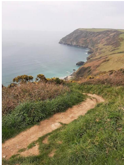
Sign and path to Lantic Beach