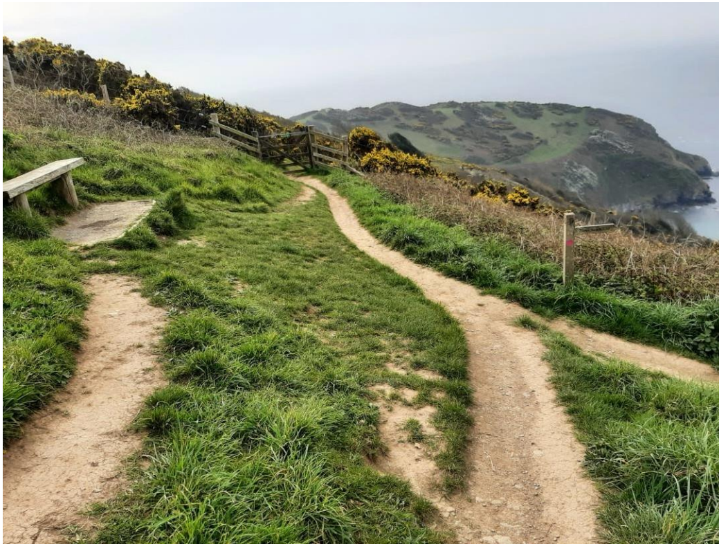
As you head towards Pencarrow Head in the distance, enjoy the views from this simple bench. The steep path down to Lantic Bay is signposted on the right