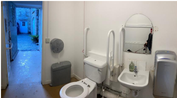
The Stables accessible toilet interior