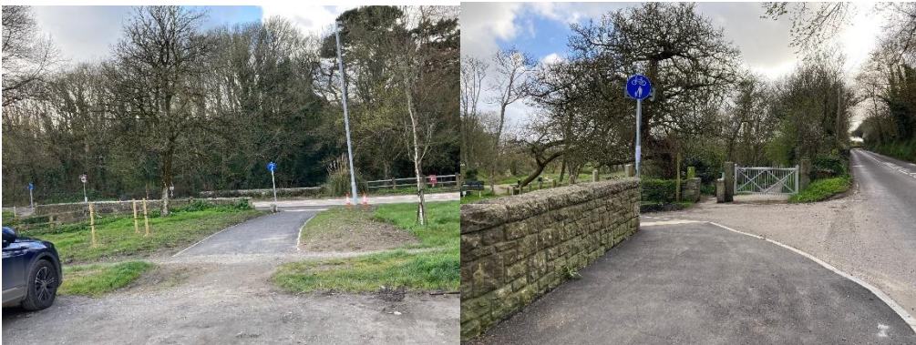
Access path from car park