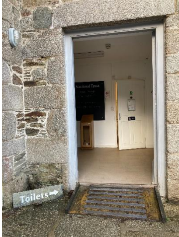
Entrance to toilet foyer