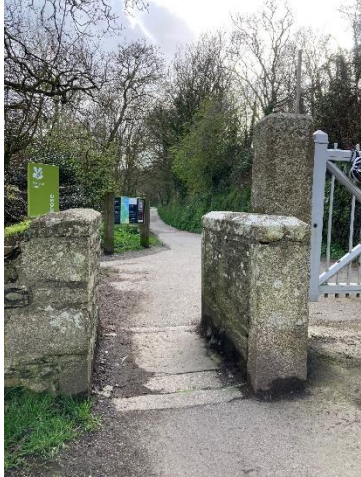
Pedestrian access to Helston Drive