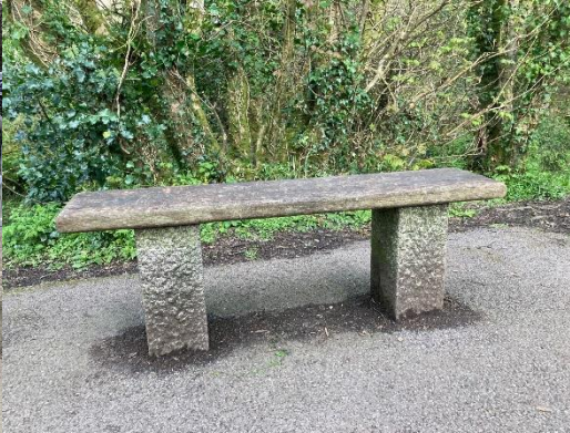
Bench on Helston Drive