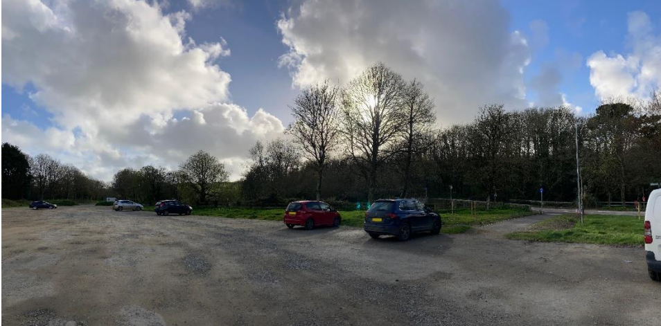
Helston Fairground car park