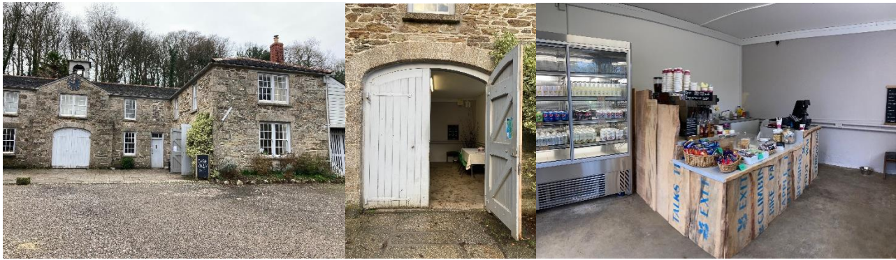
The Stables courtyard, wooden entry doors and cafe interior.