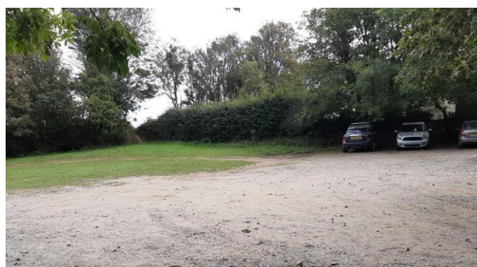
Left: Roadside car park