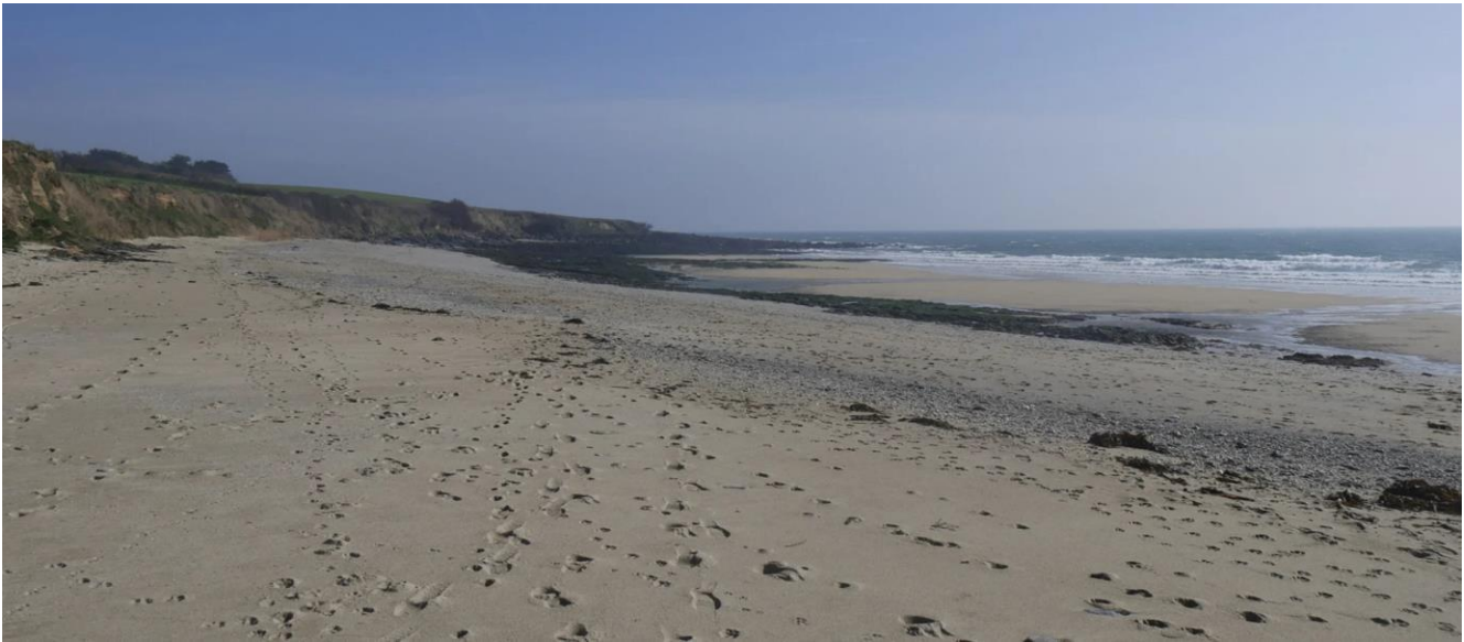
Towan Beach at Porth

Porth, near Portscatho, Truro Cornwall TR2 5EX Telephone: 01872 501062 (for local Ranger office) Email: porth@nationaltrust.org.uk https://www.nationaltrust.org.uk/porth