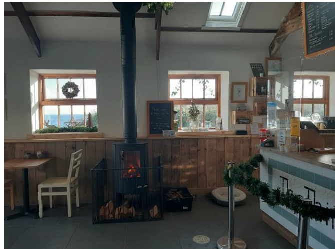
Courtyard seating and café interior with cosy woodburner