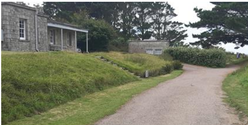
NT Holiday cottages with Tiffany's, the flat roofed square building, at the far end. The disabled toilet is on the other side of Tiffany's

Beyond the car park lie the former military buildings which once formed the officers' quarters. These are now National Trust holiday cottages, two of which (The Captain's Quarter and the Major's Quarter) are adapted for wheelchair users. Three of the cottages form a terrace set back from the path and a further small cottage, Tiffany's, stands near the start of the coastal footpath. The disabled toilet is on the far side of Tiffany's. There is another public toilet building a little further along next to St Anthony Battery.