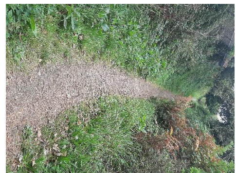
Right: level path to bird hide