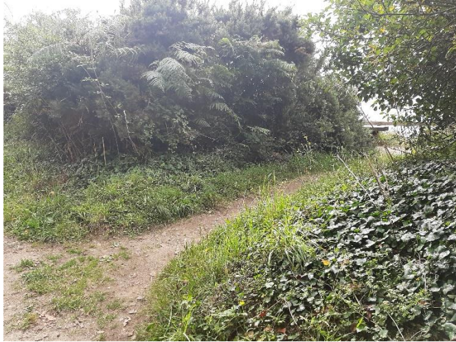
Left above: path up to first viewpoint on the bird hide path Right above: access to second viewpoint on the bird hide path