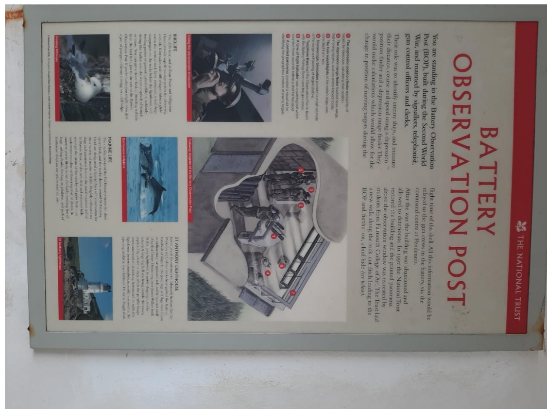
Right: Information about the Observation Post