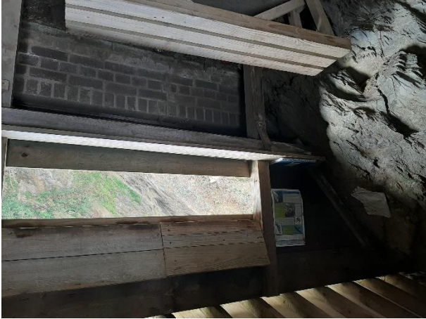
Above: Inside the bird hide Right: a view from the hide