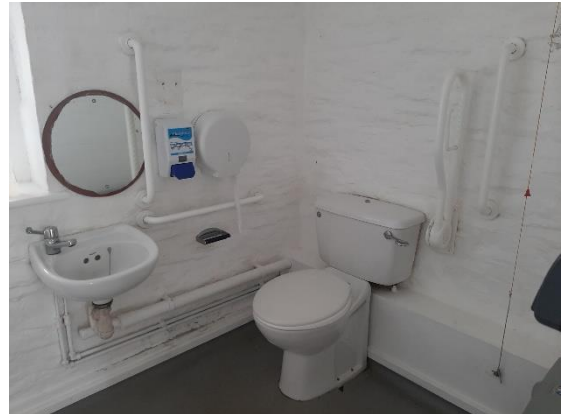
Right: interior disabled toilet