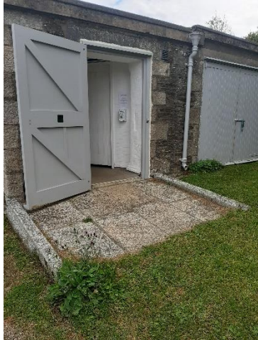
Left: Ramp to disabled toilet