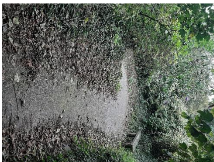
Left: sloping wheelchair accessible path down to route to bird hide