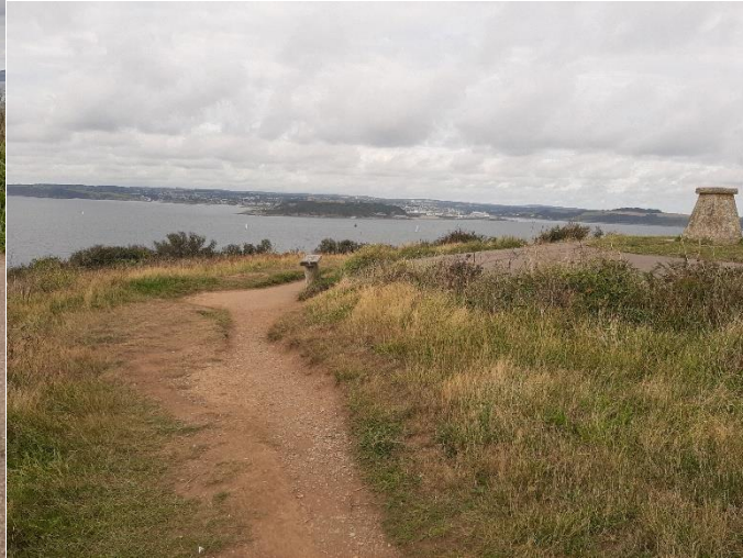
Left: first bench on the coast path just beyond Tiffy's holiday cottage