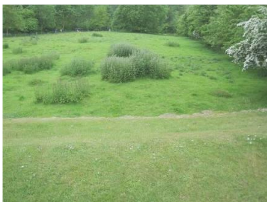
The ha-ha near Elder Court