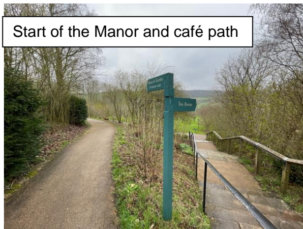
Start of the Manor and café path