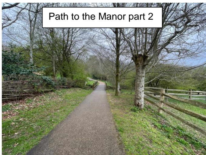
Path to the Manor part 2