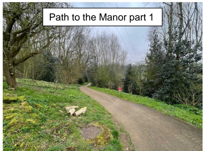
Path to the Manor part 1