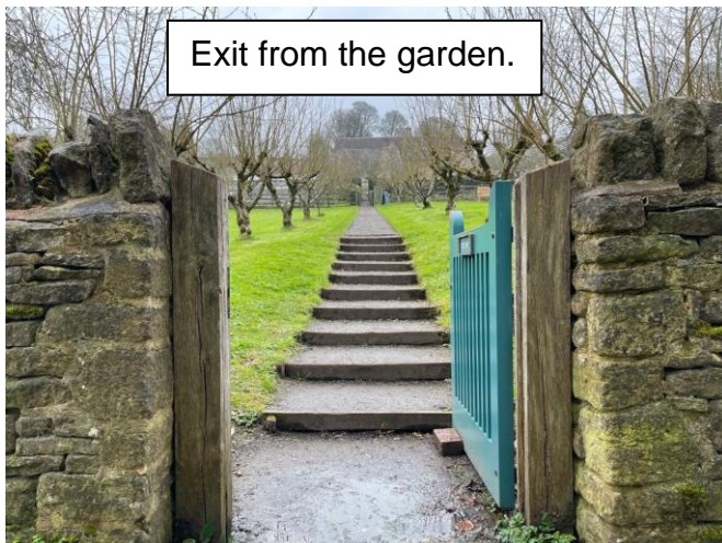
Exit from the garden.