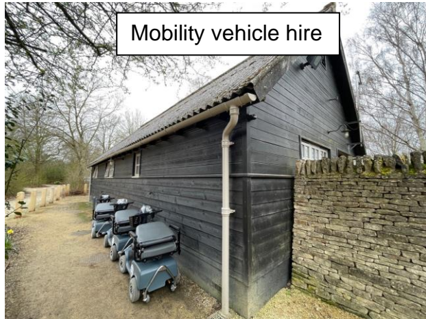
Mobility vehicle hire