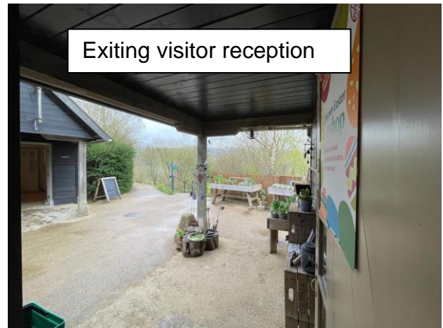
Exiting visitor reception