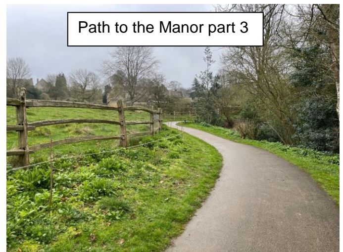
Path to the Manor part 3