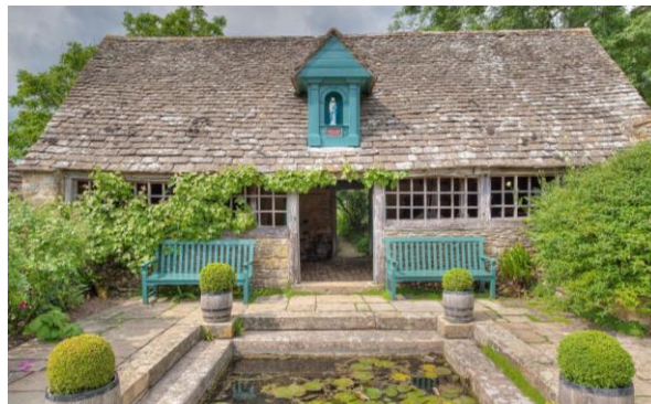
Area of open water in Well Court