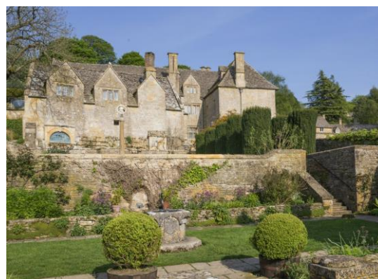
Terraced garden showing flights of steps