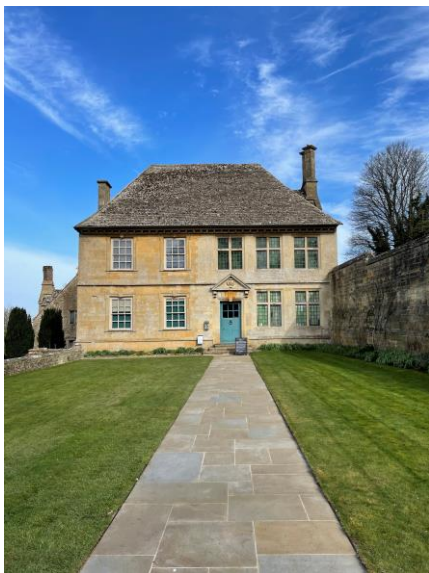
Paved path leading to the manor