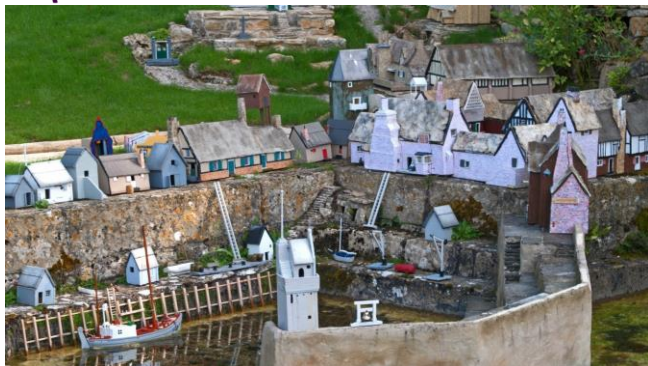
Area of open water in front of Wolf's Cove model village