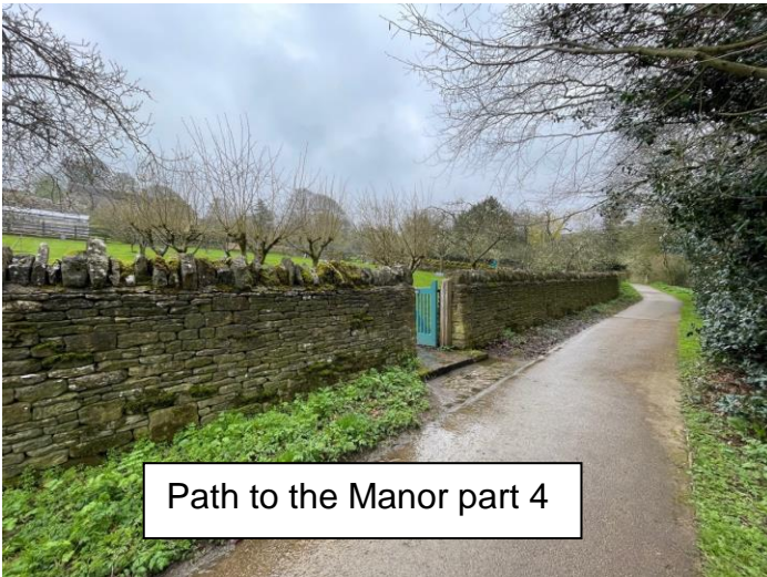
Path to the Manor part 4