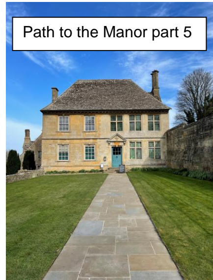
Path to the Manor part 5