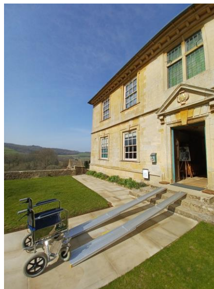
Ramp to manor front door