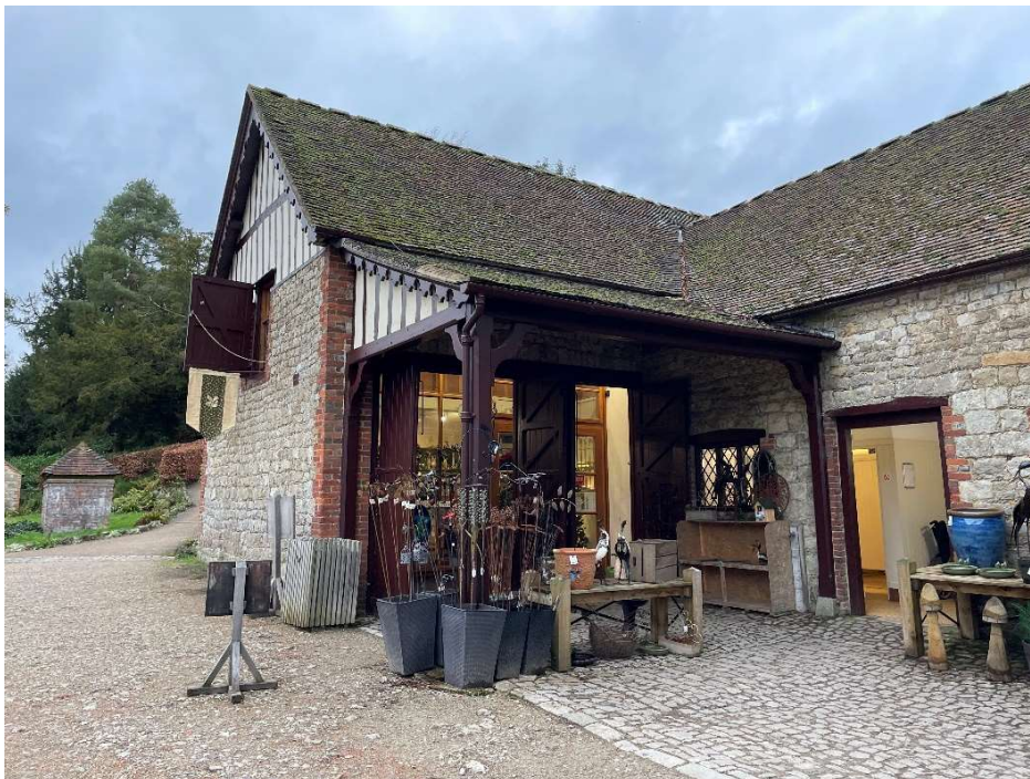
Above: exterior of the Coach House shop