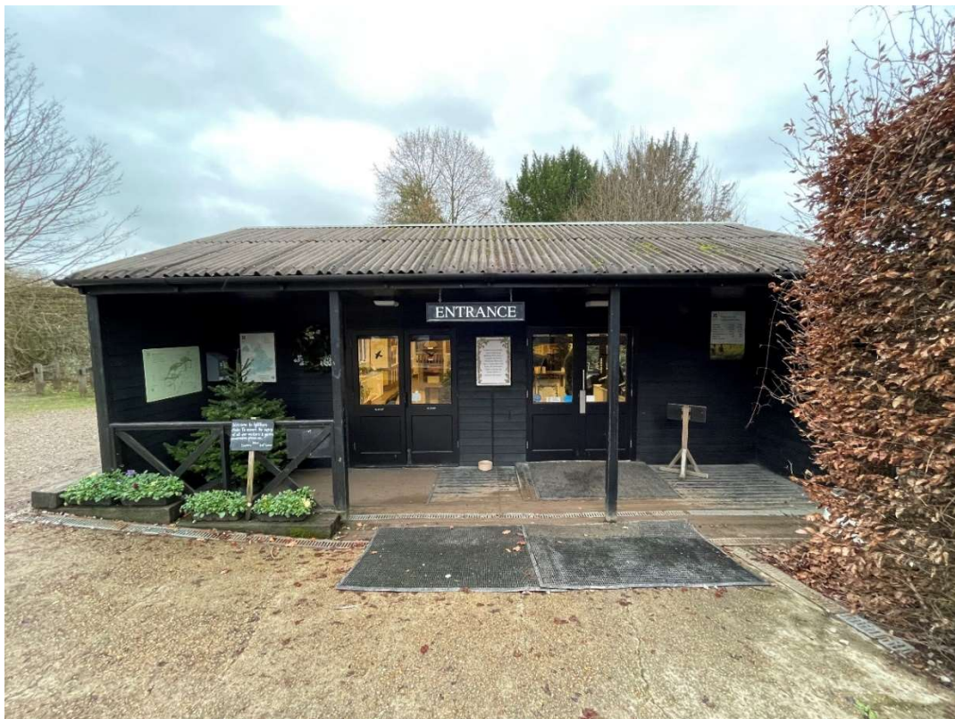
Above: The Visitor Reception Building