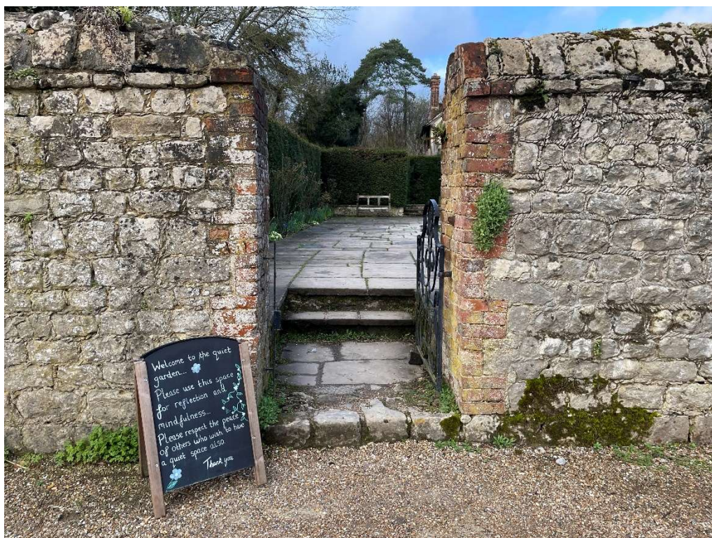
Above: Entrance to the Enclosed Garden