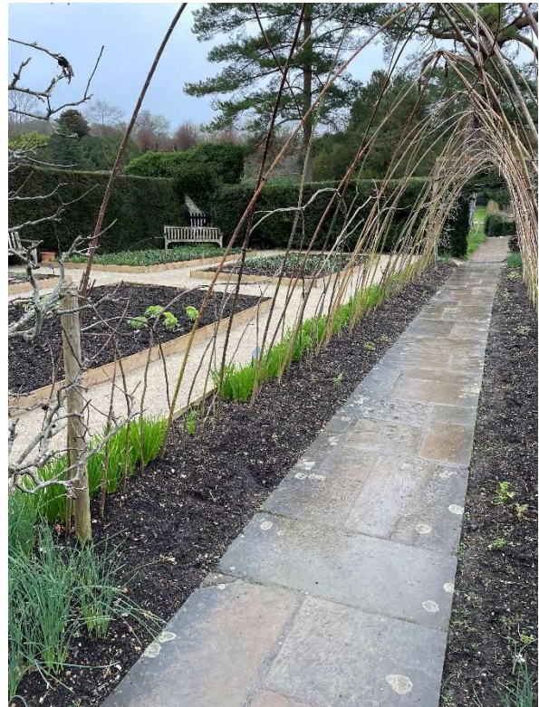
Above left: path into Cuttings Garden from Stable Courtyard