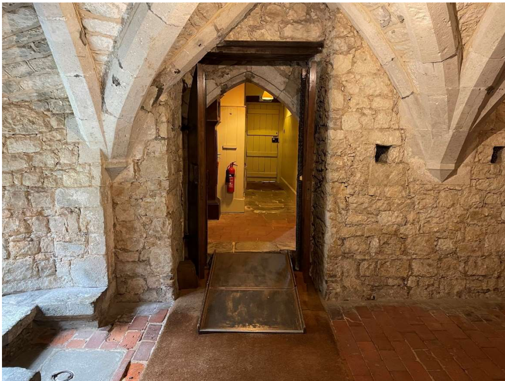
Above: Exit from the Crypt via access ramp