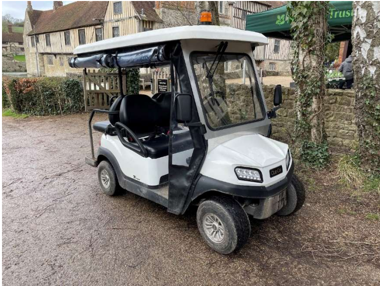
Above: the buggy parked by the Lower Gate