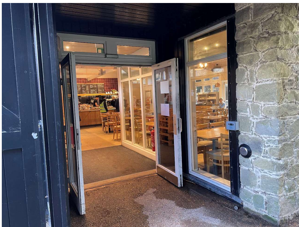
Above: Power assisted entrance to the Mote Café