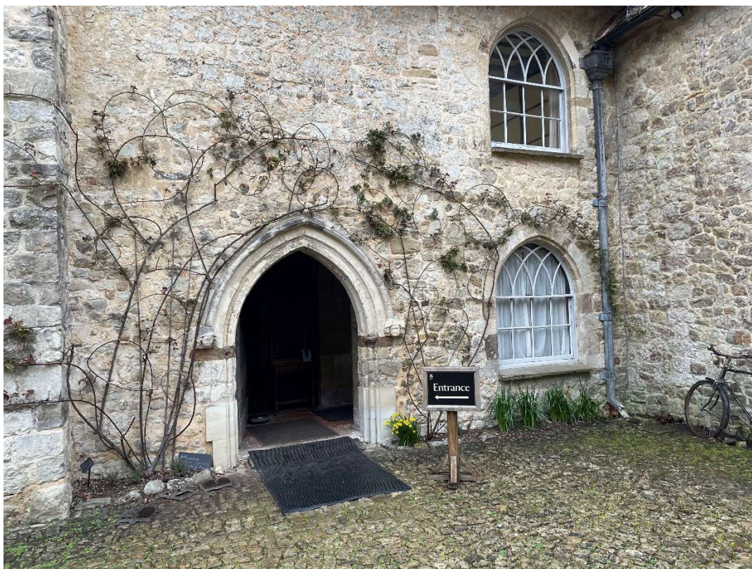
Above: entrance to the Outer Hall from the Courtyard