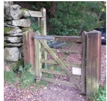
The gate from the car park to the footpath can get very

Distance: 1 mile (2 miles as a return route).