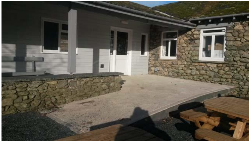
Entrance to the tearoom.