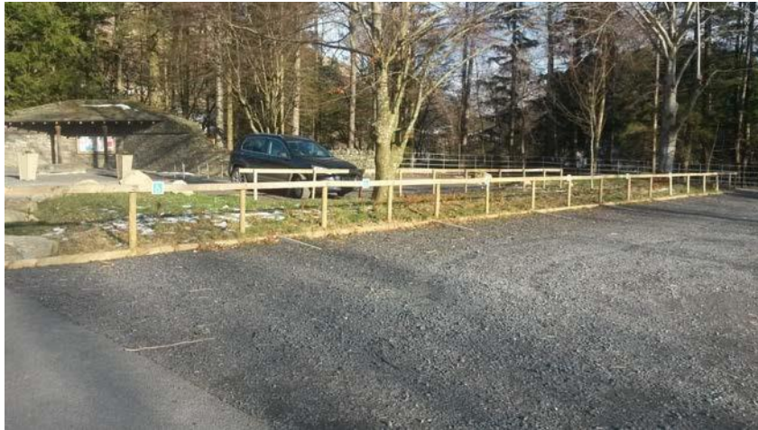
The disabled parking bays in the main car park.