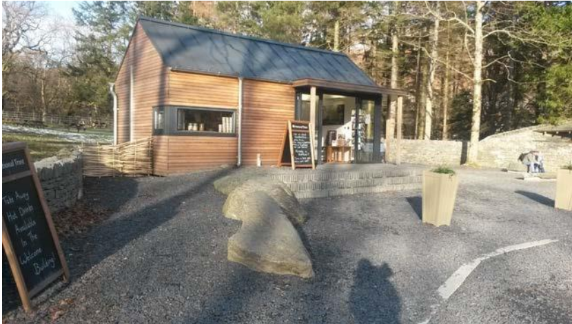
Exterior of the Welcome Building