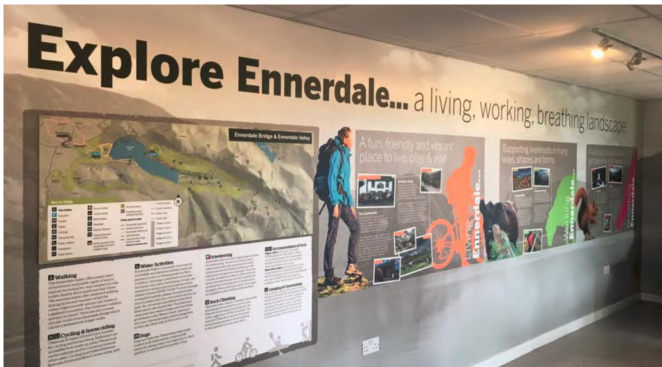
Information in the Gather café in Ennerdale Bridge.

The village of Ennerdale Bridge is the main access point into this area by car. There are two main car parks serving the valley; Bleach Green and Bowness Knott, and one small one, Flat Fell, serving Kinniside common. In the village you can find the Gather, a cafe/visitor centre with maps, toilets and information.