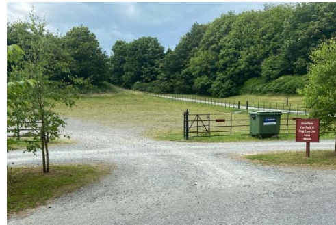
Overflow Car Park