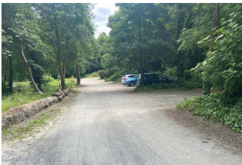
Shore Car Park