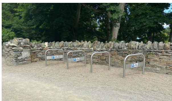
Bicycle racks in the Accessible car-park