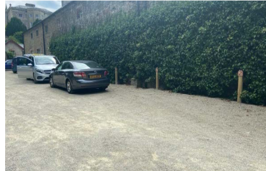
Accessible Car Park