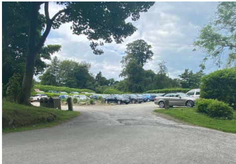
Main Car Park