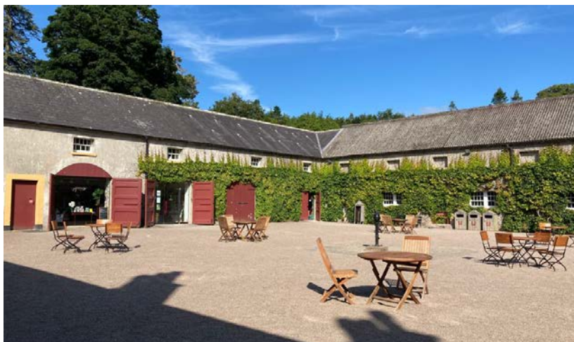
Stableyard area with seating, Shop and Tea-room entrances