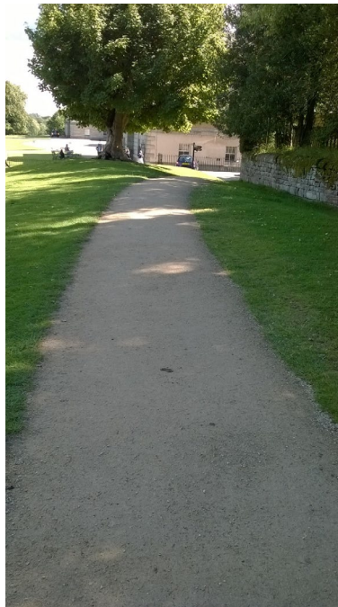
Pathway from the Visitor Reception Building