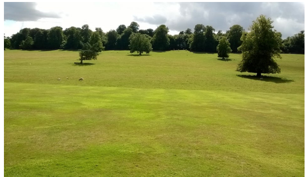
The hidden Ha-Ha at the end of the gardens.

If you would like to discuss access before your visit, please contact the property office on 01332 842191 or email kedlestonhall@nationaltrust.org.uk