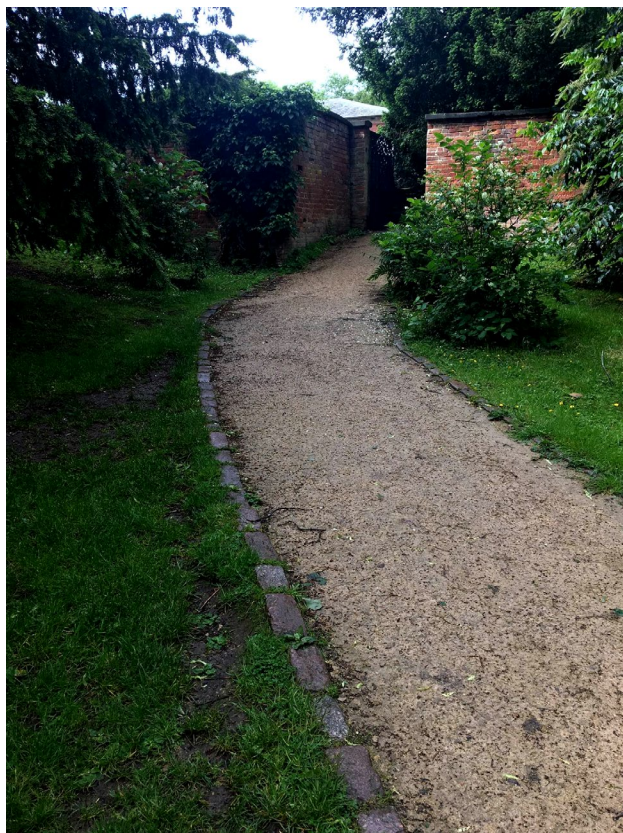
Step-free access to the Church via the Gardens.