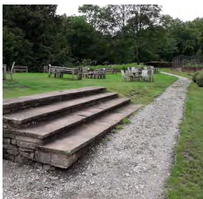
Entrance to tearoom lawn