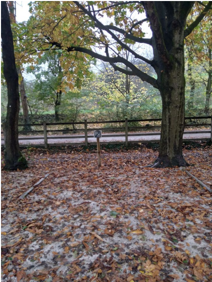
Example of accessible parking bay

The car park entrance is located at the end of a narrow road, 500m from a T-junction on Thorpe Road. There is a brown sign from this junction. The road down to the car park is narrow with passing places. The car park surface has a top layer of loose limestone grit. There are 9 designated accessible parking bays.