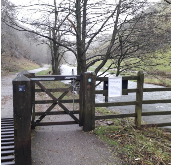
Gate located on the tarmac path to the Stepping Stones

Access from the car park to the start of the walk is via a choice of 2 routes. The path on the right-hand side of the toilet block (nearest the river) has a cobbled section and is uneven in places. The path on the left-hand side of the toilets is level tarmac. These paths join after approximately 100 metres.