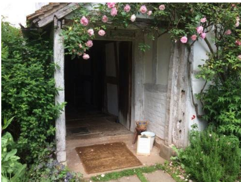
Entrance to manor house