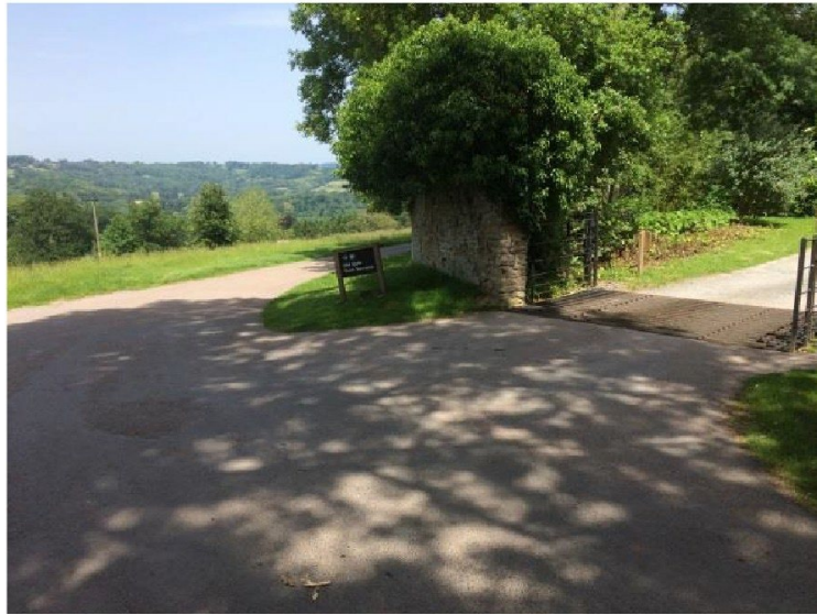
The entrance to the top car park and drive leading to Lower Brockhampton