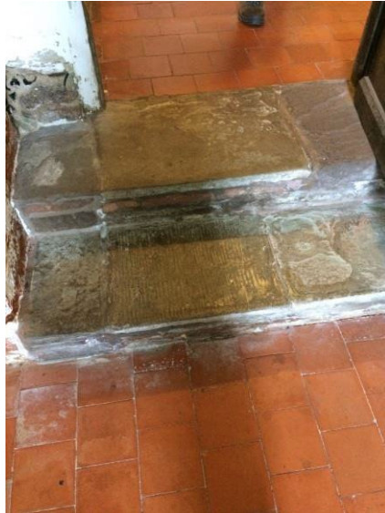
Steps down into the kitchen