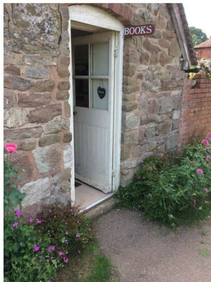
Entry to the second-hand bookshop