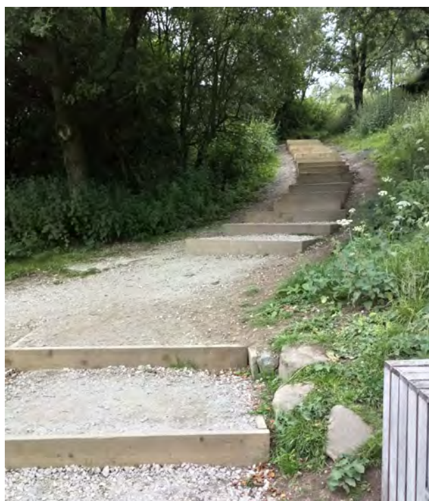
Steep steps leaving the car park

The second formalised path leaves the car park up steep steps close to the bike racks. It is an average of 1.20m wide and is not a stable or firm surface along its full length. It is suitable for pedestrians.