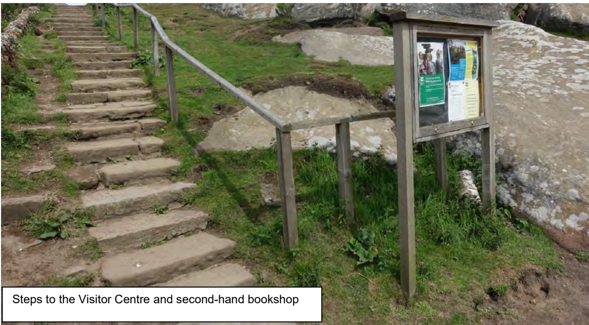
Steps to the Visitor Centre and second-hand bookshop

Alternate access is available to the east of the Visitor Centre, up a set of steps.