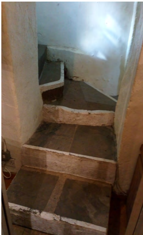
Spiral steps to the exhibition room

Access to the upstairs exhibition space is via a steep spiral staircase that is narrow in part. The bottom four steps have white lines along the edges; a hand rail is in place for the upper steps. Upstairs the floor is carpeted and uninterrupted.