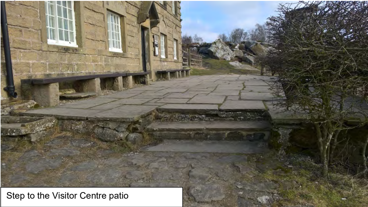
Step to the Visitor Centre patio

Alternate access is available to the east of the Visitor Centre, up a set of steps.