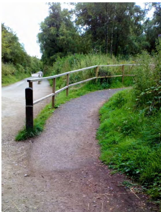
Start of the resin accessible path