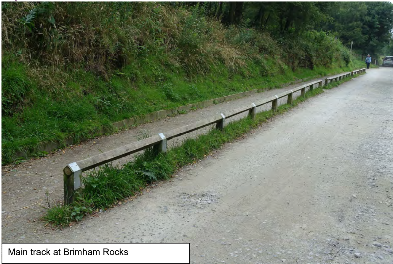
Main track at Brimham Rocks

After 89m, a resin-bonded footpath branches from the main track. This smooth, stable path meanders through the main rocks area over 458m and is 1.5m in width. It is suitable for pedestrians, pushchairs, mobility scooters and powered wheelchairs. A map of the accessible route is included at the end of this Access Statement.