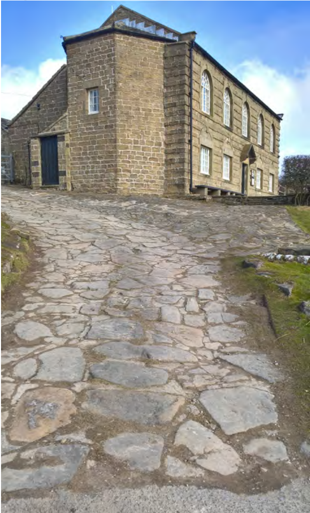
Vehicle ramp to the Shop and VC