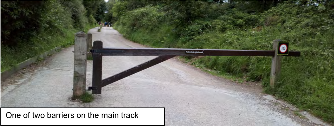
One of two barriers on the main track

There are payment machines in the car park. The cost to park a car is £6.50 for up to 4 hours or £10 all day. Minibuses and motorhomes are £12, coaches are £15-20 (all must be pre-booked). Parking is free for National Trust members. Blue badge holders park for free with the display of their badge.