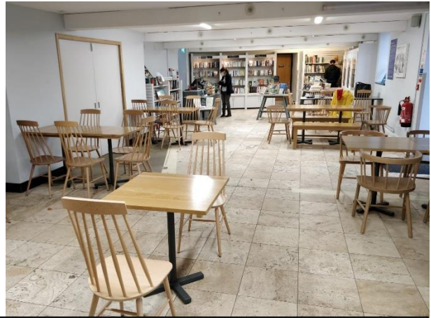
Left: The Long Barn and outside seating area; Right: inside seating area for the Café