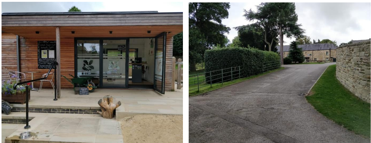
Left: The Visitor Welcome Building; Right: the path from the Visitor Welcome building to the Long Barn