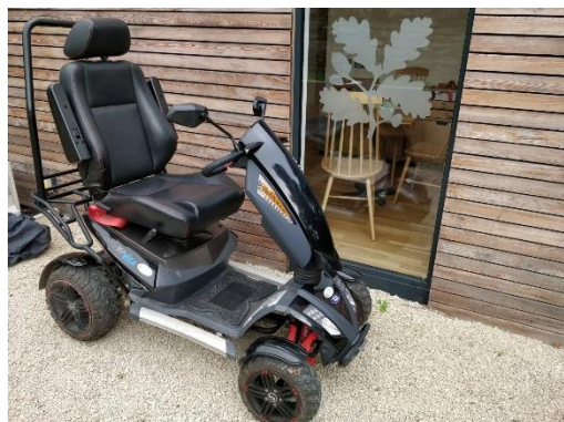
One of the PMV's available for hire

We have two powered mobility scooters available for use in the gardens. These are larger than the standard mobility scooter, allowing you the opportunity to reach areas of the garden that would not otherwise be accessible. Each mobility scooter seats one person.