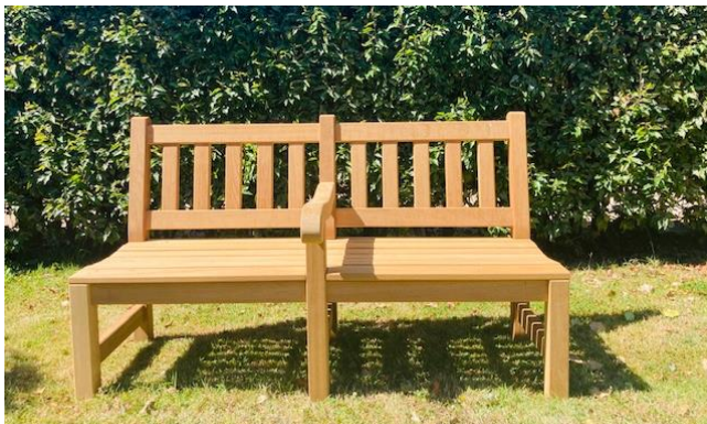
Accessible garden bench in the Union Jack Gardens