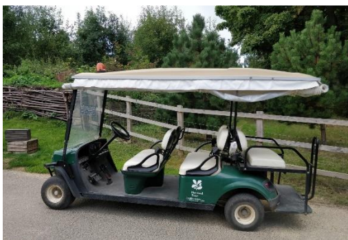
The buggy shuttle service

The buggy shuttle service, which is largely staffed by volunteers, runs every day that we are open. For most of the year, it is available between 11am & 3pm. During winter opening hours, this moves to 10.30am & 2.30pm.