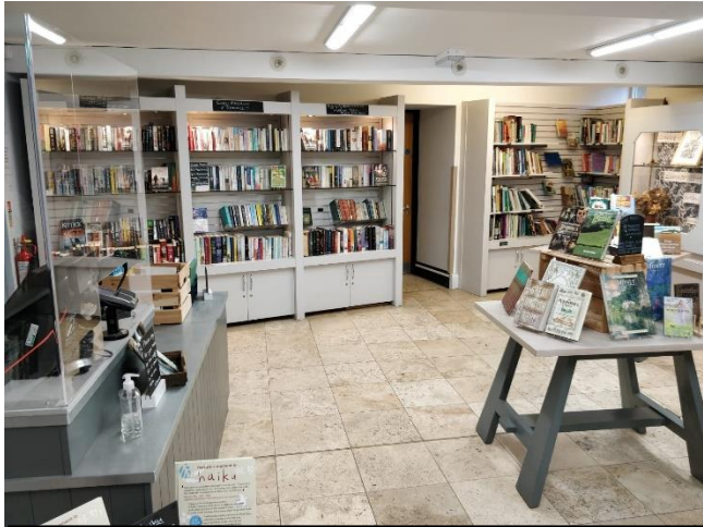
The Second-hand bookshop