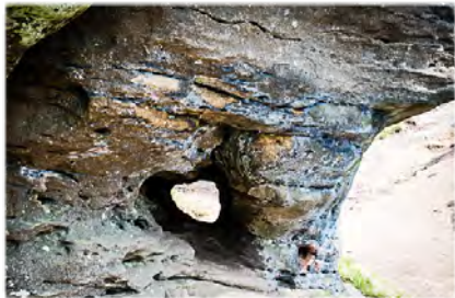
7. Smartie Tube