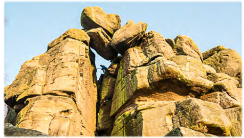
6. Lover's Leap