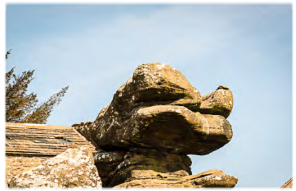
2. Rhino Head