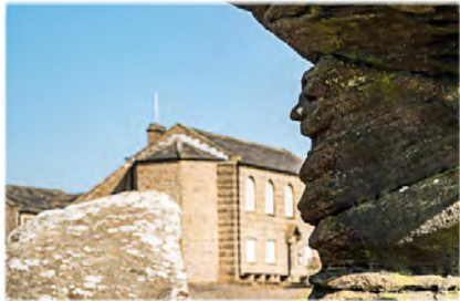
3. Druid's Profile