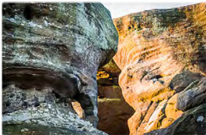
9. Elephant's Head