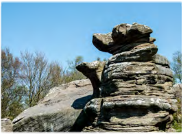
1. Dancing Bear