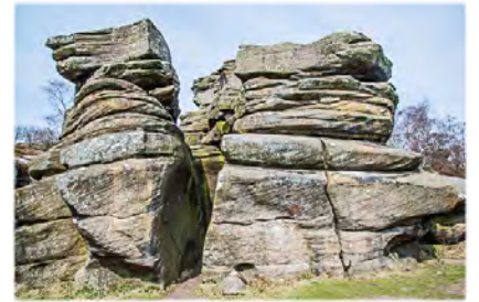
4. Split Rock