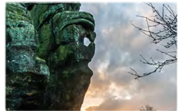
* Tiger's Head

Did you find them all? Well done! Here's a bonus one. If you can find this you are a top spotter.