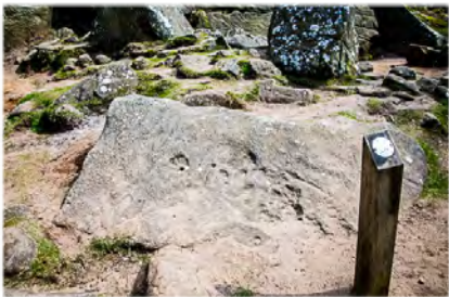
5. Lizard's Footprint