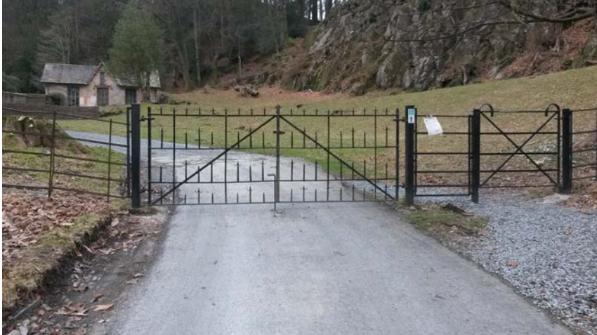
The gate at the top of the access road.