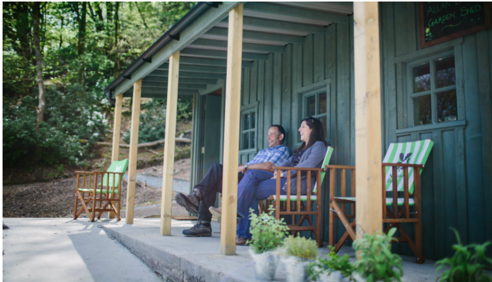
Seating at the front of the Garden Bothy.