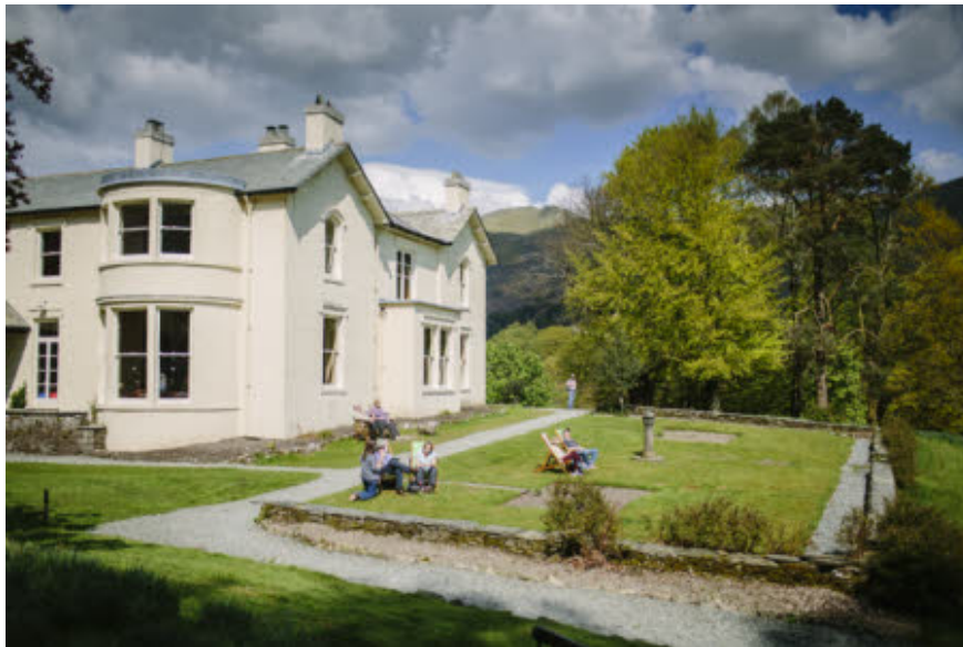
Garden area to the rear of the house