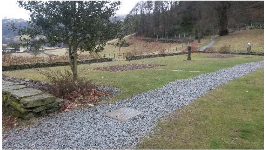
The garden paths around the outside of the house.