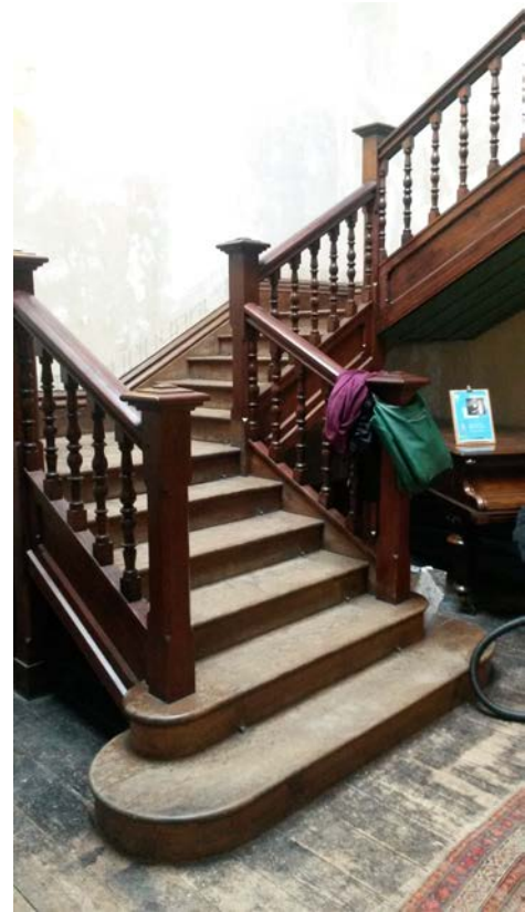
Stairs up to the first floor