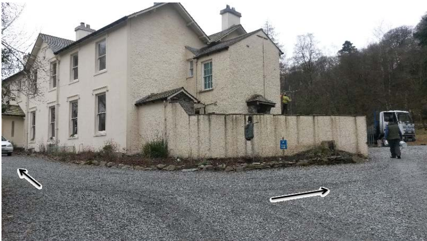
On arrival, front door is to the left. Blue badge parking and accessible entrance are to the right.