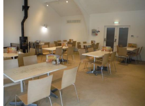
Knoll Beach Café Interior