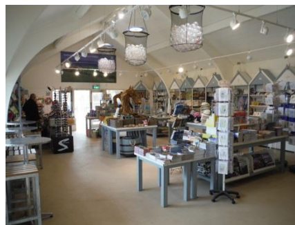
Knoll Beach Shop Interior