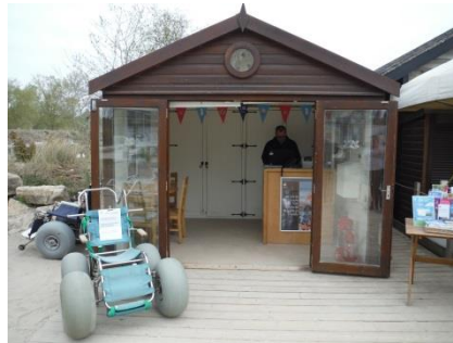
Knoll Beach Visitor Reception showing beach accessible wheelchair

The Knoll Beach Office is based in a beach hut which is accessible from the turning circle at Knoll Beach car park. Other than parking, Studland Beach is free to access, and you can find out about the local area and the work of the National Trust at our Office. The floor in this building is level concrete covered in non-slip vinyl and the wall surfaces are wood panelled. One side of the building is glazed and doors and the lighting is LED. The reception desk is 110cm high but there is a lower area, 75cm high. Seats are available in the hut. A hearing loop is not fitted.