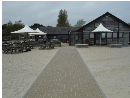
Pathway from car park to Café and Shop

Parking at Studland is pay and display or at the entrance hut at Knoll Beach. There is a pay and display machine located near the parking area for disabled visitors. Prices are shown on the machine. Parking is free for National Trust members (we ask that you scan your membership card at the machine). Parking charges do not apply to blue badge holders.