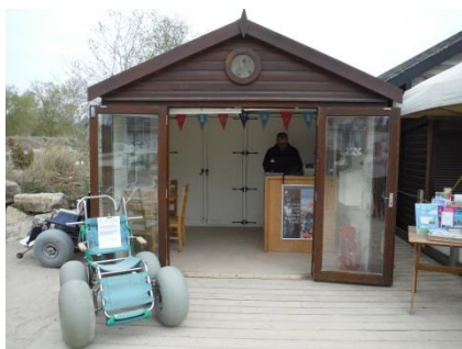
Knoll Beach Visitor Reception showing beach accessible wheelchair

The Knoll Beach Office is based in a beach hut which is accessible from the turning circle at Knoll Beach car park. Other than parking, Studland Beach is free to access, and you can find out about the local area and the work of the National Trust at our Office. The floor in this building is level concrete covered in non-slip vinyl and the wall surfaces are wood panelled. One side of the building is glazed and doors and the lighting is LED. The reception desk is 110cm high but there is a lower area, 75cm high. Seats are available in the hut. A hearing loop is fitted.