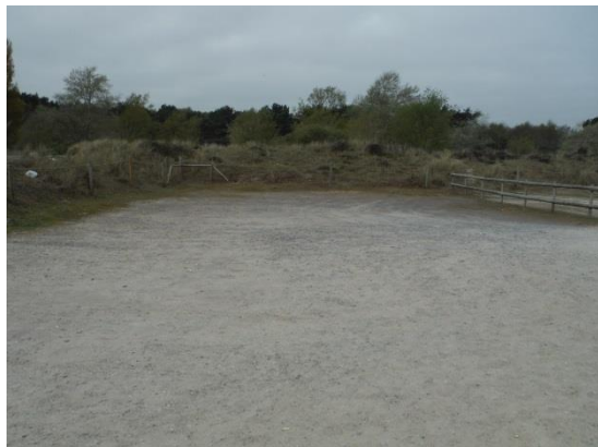
Disabled parking area