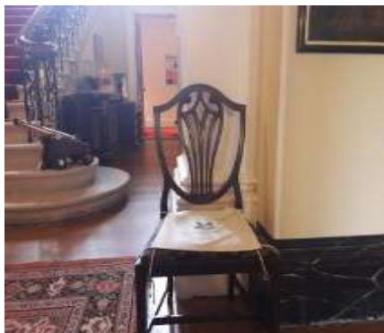
Marked chairs for seating