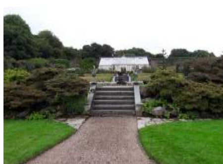
Steps through central route