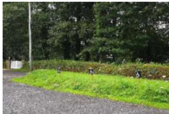
Disabled parking bays