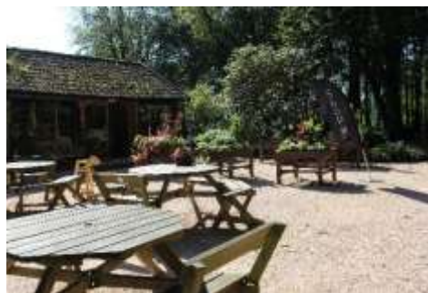
Seating outside shop