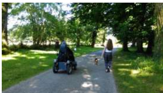
Part of trumper route