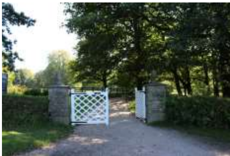
Entrance from main car park