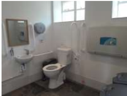
Toilet with baby change