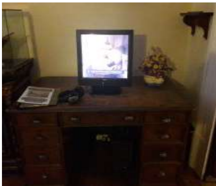
Virtual tour with audio