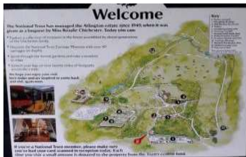
Information board near entrance