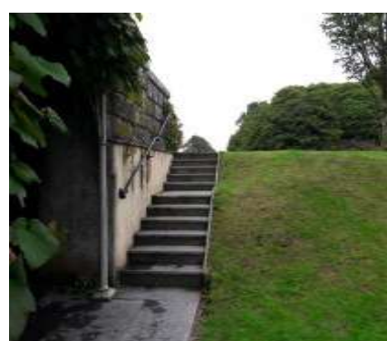
Alternate access via steps