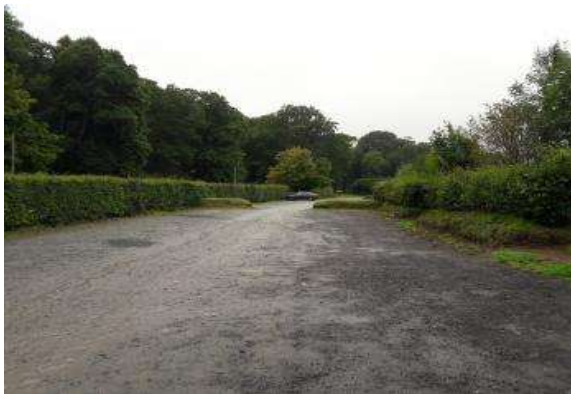
Main car park