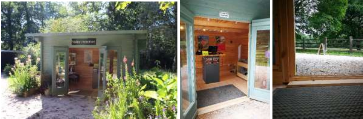
Entrance to Visitor Reception