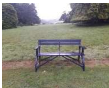
Seating in the grounds