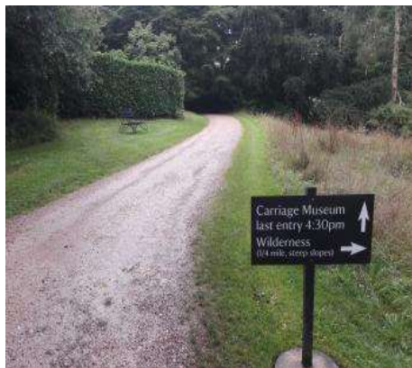
Uphill route to museum