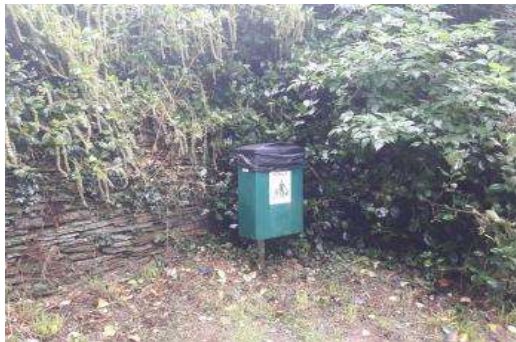
Dog waste bins