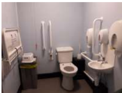
Toilet with baby change