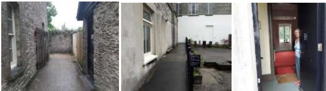
Route to rear entrance Access ramp to rear door Rear access entrance