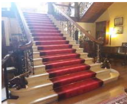
Stairs to first floor