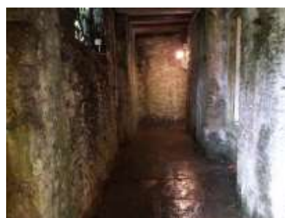
Passageway with uneven floor