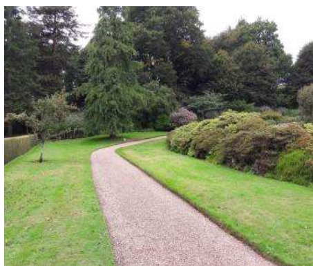
Level access routes