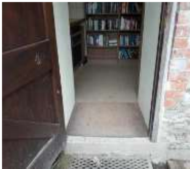
Entrance with step