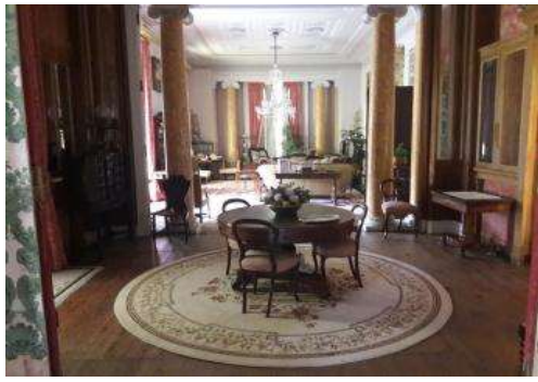
An internal view