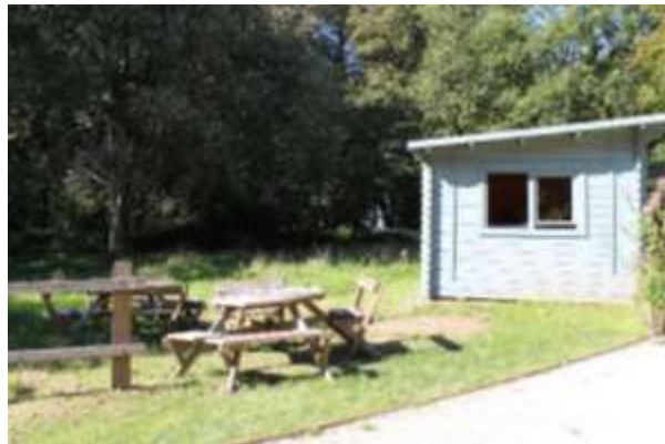
External seating by Visitor Reception