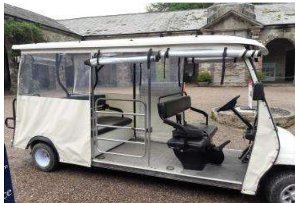
Golf buggy can carry a wheelchair user