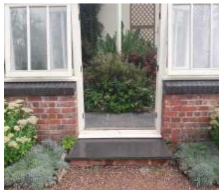
Step in to Green House