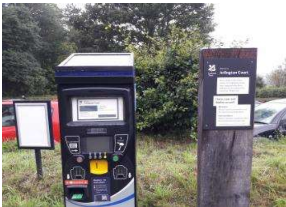
Main car park pay machine