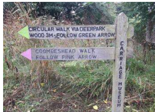
Information board with marked colored walks