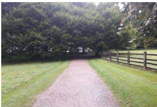
Route from main car park to Visitor Reception