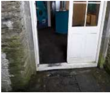
Internal entrance with step