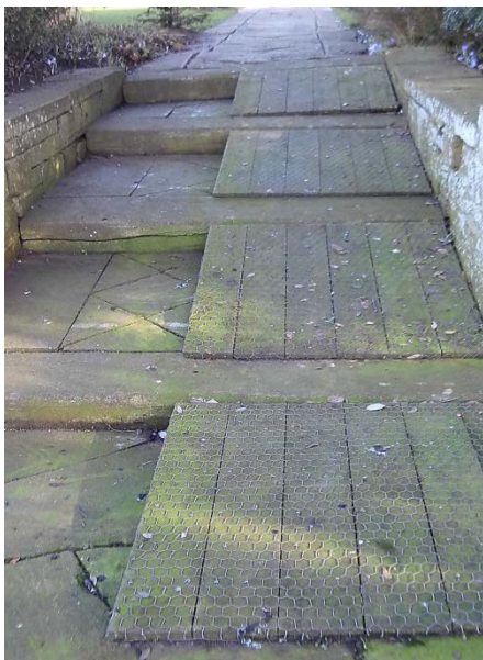
Steep gradient ramp

Visitors will receive a property map at reception. There is a small but steep ramp (1:1 gradient) from the courtyard over the door lip and down 1 step into the garden. There are a further 3 steps down into the garden, and a ramp to the right-hand-side of a steep gradient (1:6).