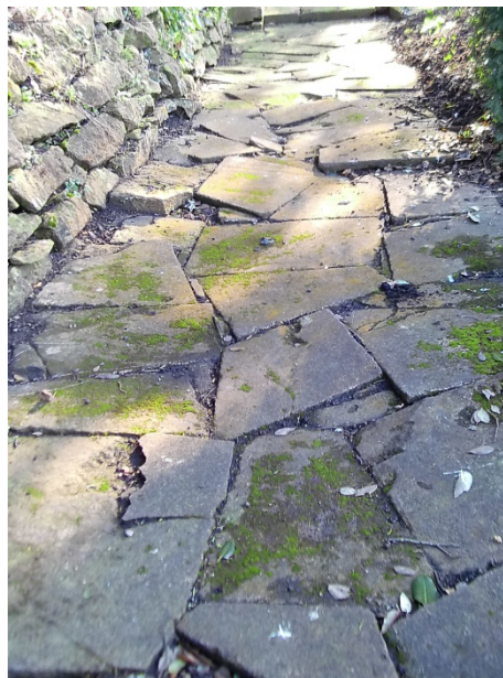
Uneven, narrow path