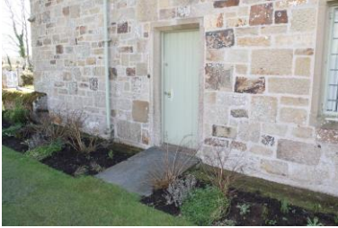
First floor access