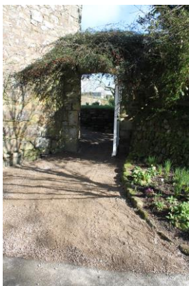
Path to reception (gravel, 1100mm wide gate)