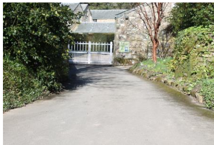
Tarmac path towards property entrance