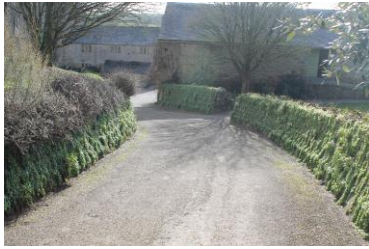
Path from Kayling lawn