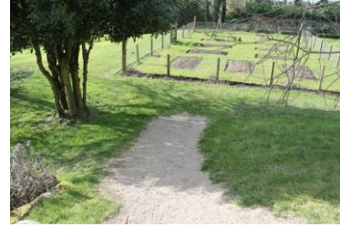
Path to vegetable garden