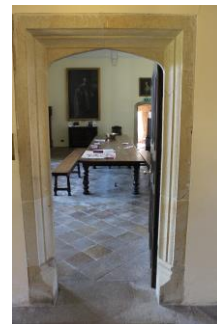
Entrance to Great hall