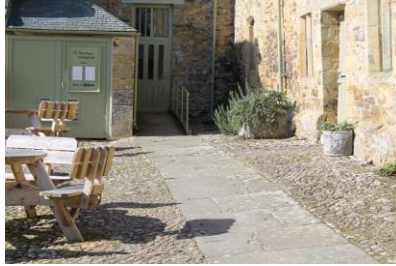
Entrance to Barn restaurant