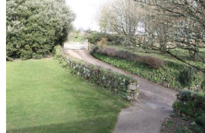
Sloping tarmac path