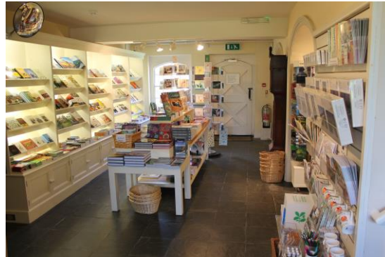
Shop exit door