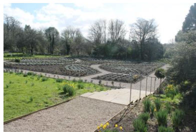
The Knot garden