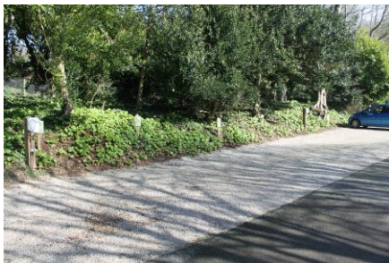
Disabled parking area