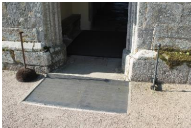
Grating at house entrance