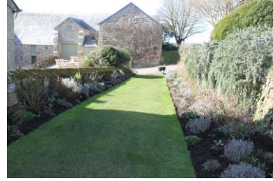
Grass path to first floor