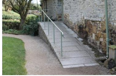
Ramp to Hayloft