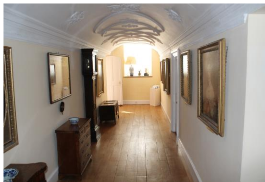
Narrow passages on first floor