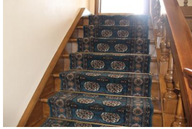
Stairs to first floor