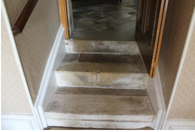
Steps to Drawing room