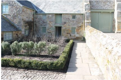
Entrance to lavatories