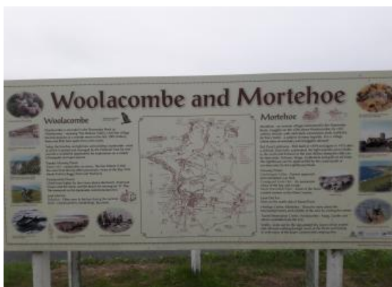
Information Board outside TIC