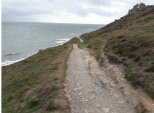
Route near Morte Point