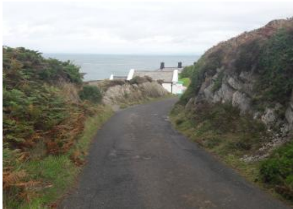
Last part of the route