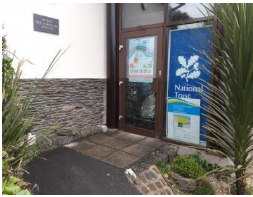
Rear entrance - level access