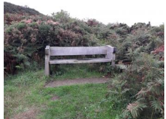
Sole wooden seat