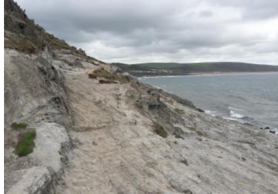
Rocky and uneven at Morte Point