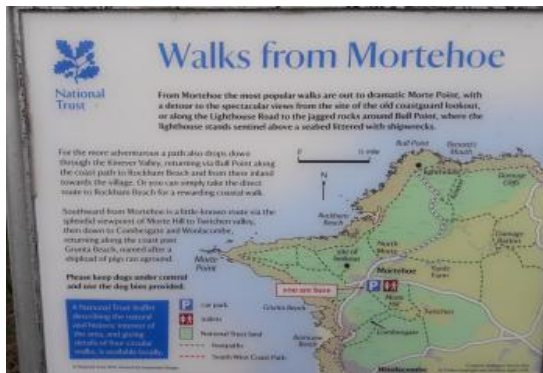
Walks from Morteheo