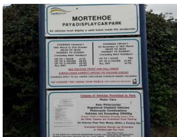
Summer and winter charges apply