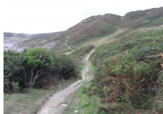
Coast path from Morte to Bull Point