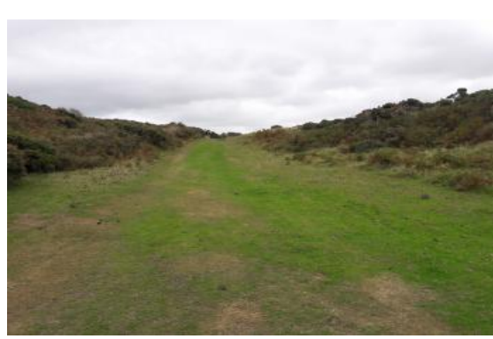
Early part of the route