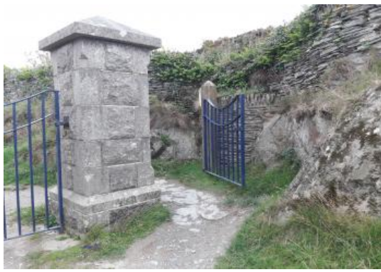
Gate near start of route