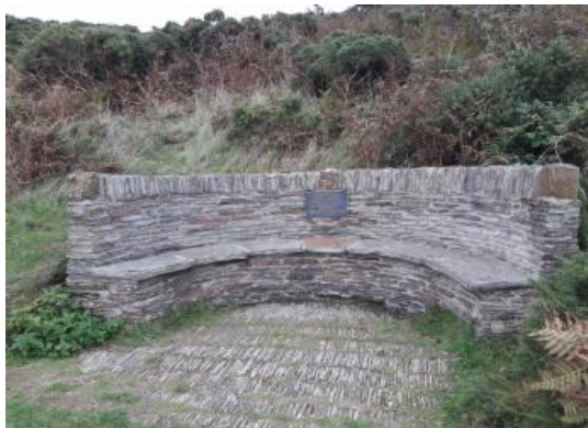
Seating near access gate