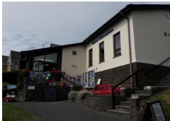
Tourist Information Centre