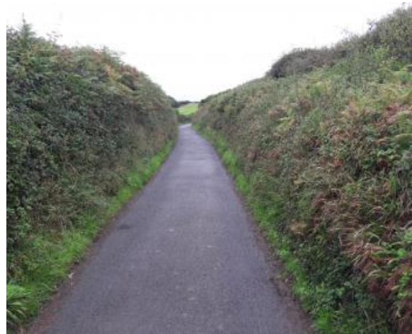
Part of the route