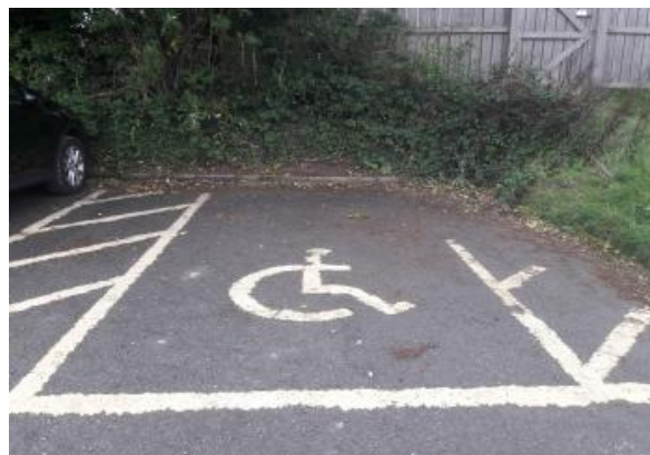
Disabled parking space