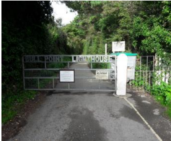
Gate with side access gate near start