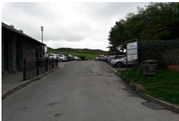
Entrance to car park