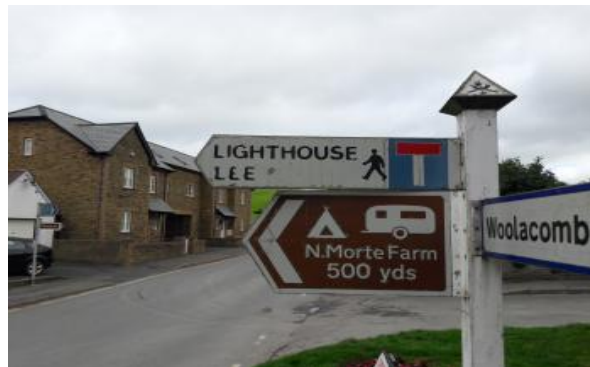
Sign to Lighthouse by car park