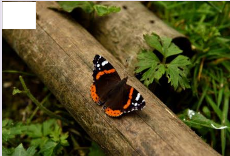
Red admiral – Gorgeous butterfly with distinctive red and white markings. See if you can spot one sunbathing.