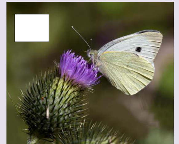
Large white – Will fly along hedgerows and quite high.