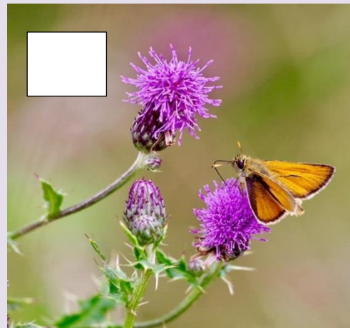
Small skipper – A tiny butterfly with a moth like wing shape and large eyes.