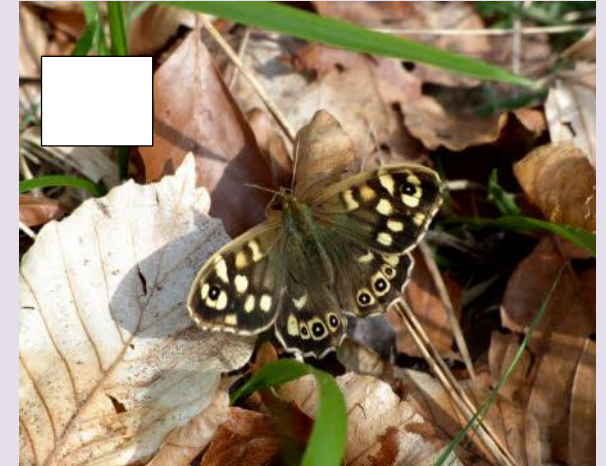
Speckled Wood – Loves flying along sun-dappled woodland edges.