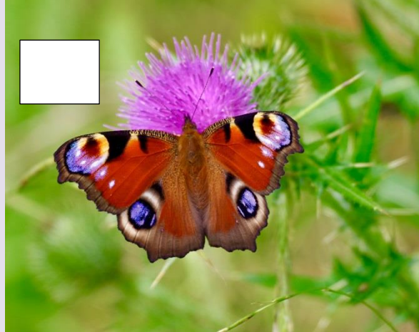
Peacock – Big, bright and bold with its famous eyespots to scare away predators.