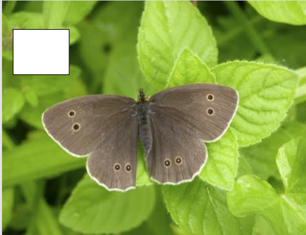
Ringlet – A very dark butterfly that fades over the summer. Look for the small rings on its wings.