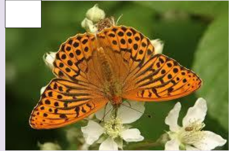
Silver-washed fritillary – This beautiful, large, orange butterfly can be seen on bramble flowers and thistles.