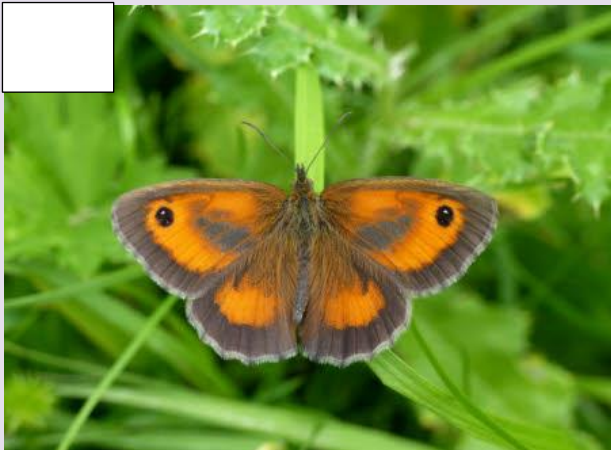
Gatekeeper – This small orange butterfly has a dark edge and black wing spot. It sips nectar from flowers in hedges and gateways.