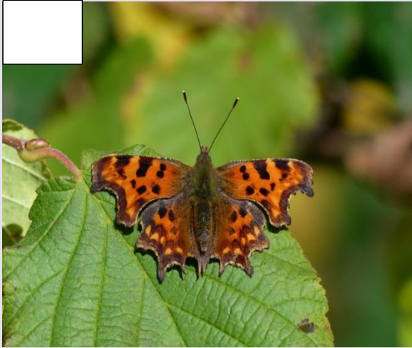
Comma – A master of disguise. When it folds its wings it looks like a crumpled leaf. Its caterpillars look like bird poo!