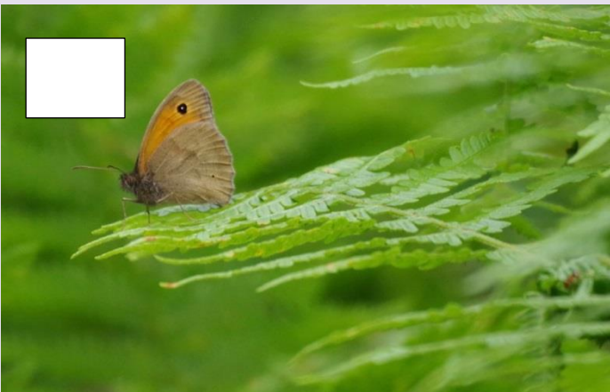
Meadow brown – Often flies up from long grass and has a black spot on an orange wing.