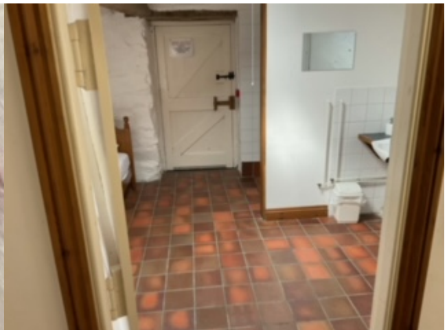
Lower ground floor bedroom