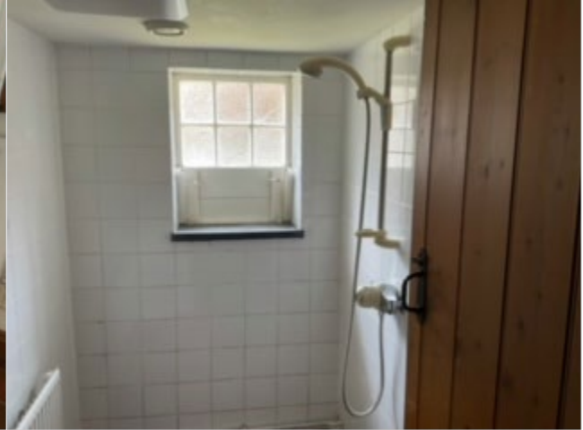
Downstairs washrooms showers