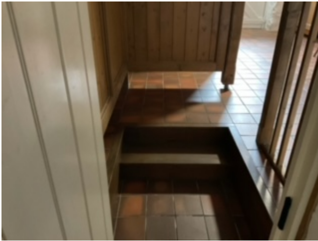
Access to Ground Floor Dorm