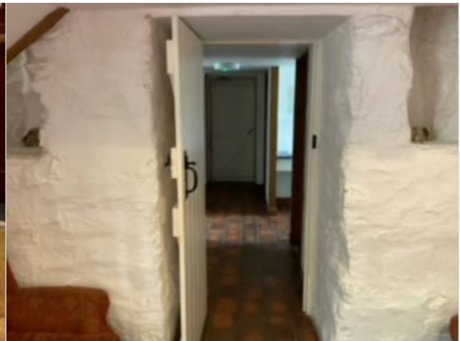
Access to downstairs washrooms and Dorm