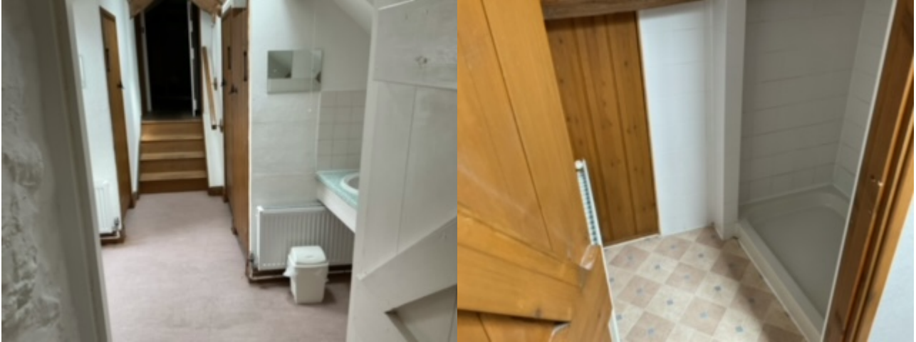
Upstairs Dorm washroom