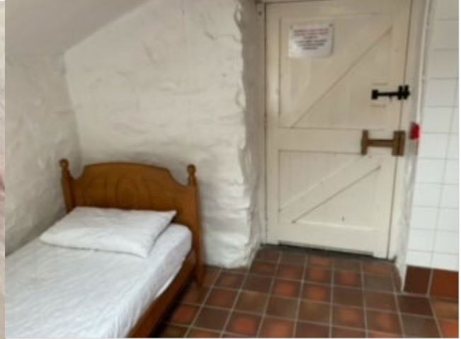
Lower Ground floor fire escape