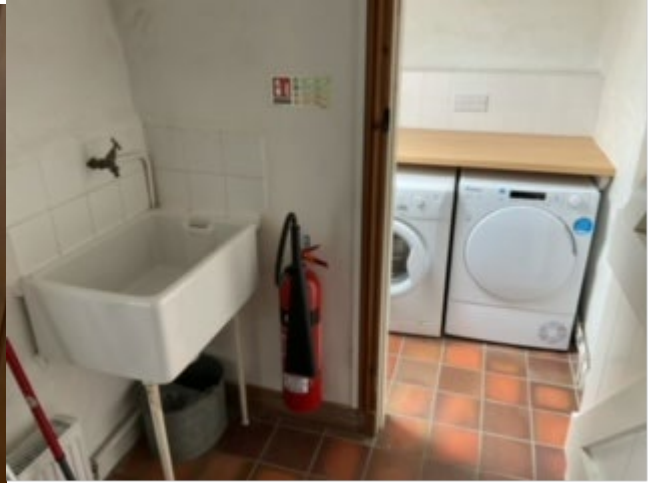
Ground floor Washer, Dryer, Butlers sink