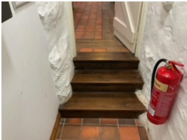
Access to lower ground floor