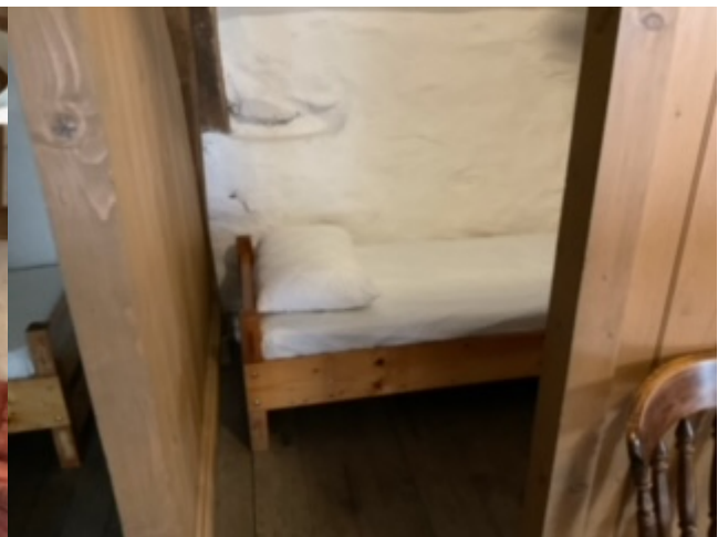
First floor beds