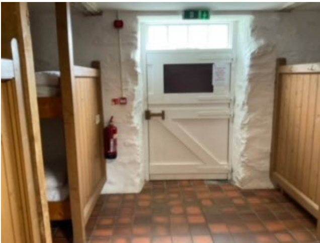
Downstairs Dorm Fire Exit