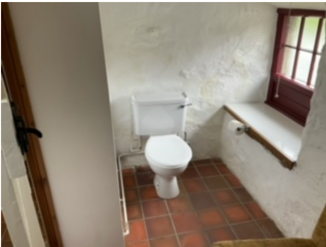
Lower Ground Floor toilet.