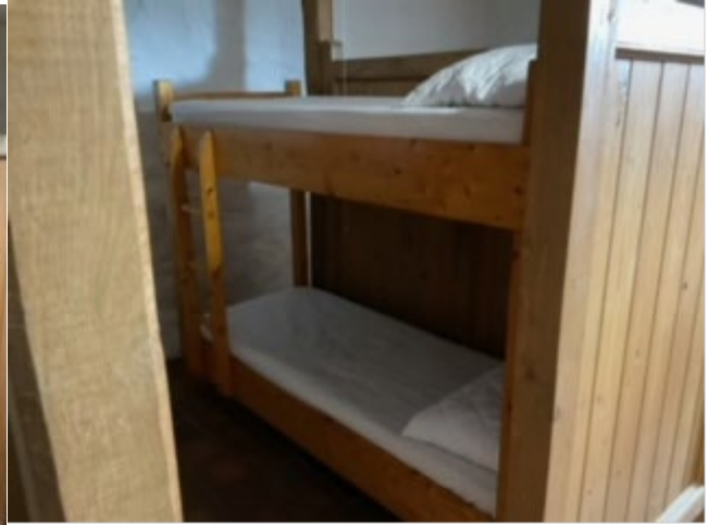
Downstairs Dorm Bunk Beds