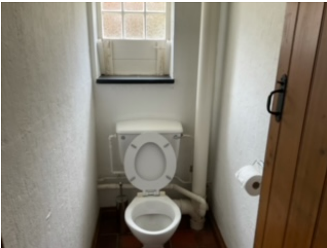
Downstairs washroom toilets