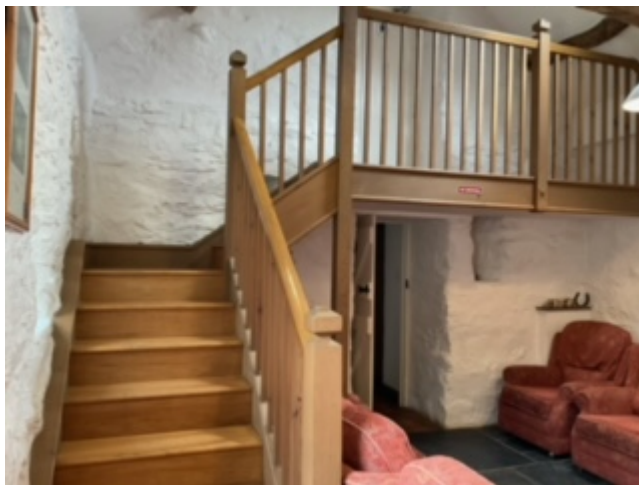
Stairs to first floor