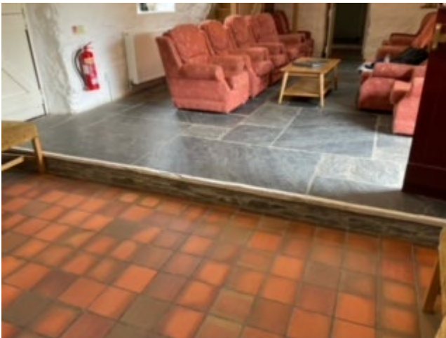
Main Seating Area