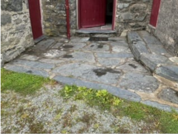
Steps to entrance