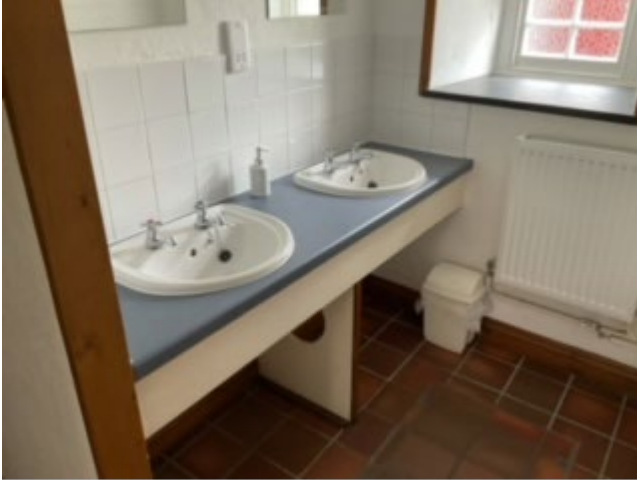
Downstairs washroom sinks