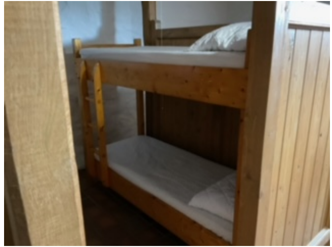
Ground floor Dorm bunk beds