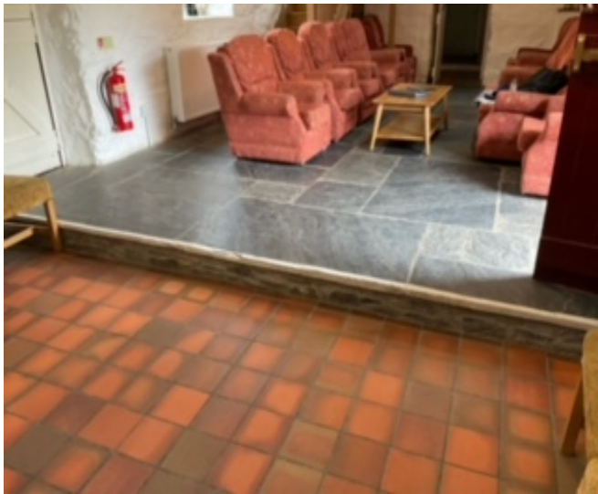
Main seating area

Hendre Isaf Ysbyty Ifan Nr. Betws-y coed Conwy North Wales LL24 0HP