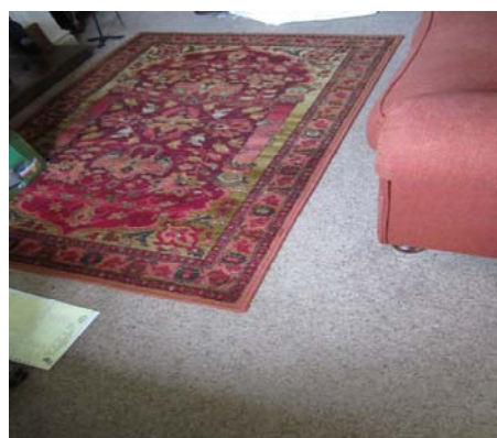
Lounge carpet and rug