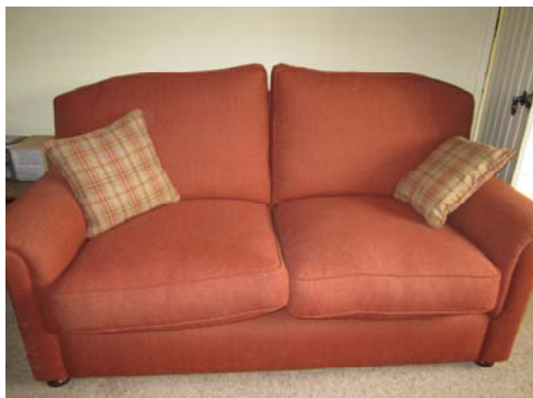
Burnt orange sofa