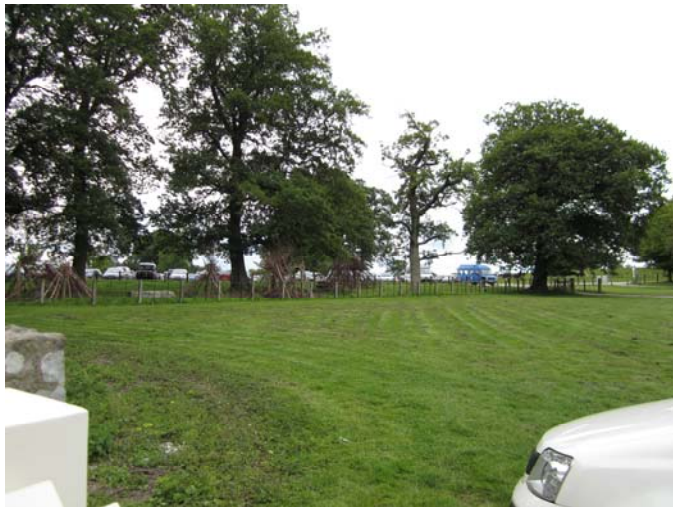
Main visitor car park beyond trees