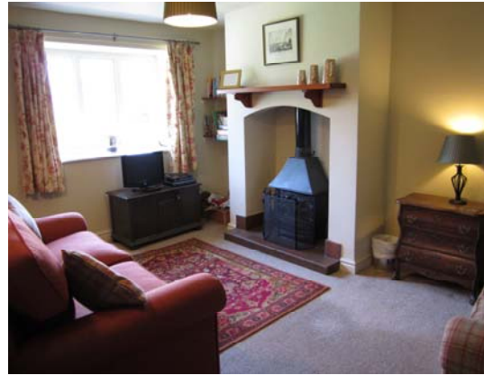
Wood burner and good natural light from front window