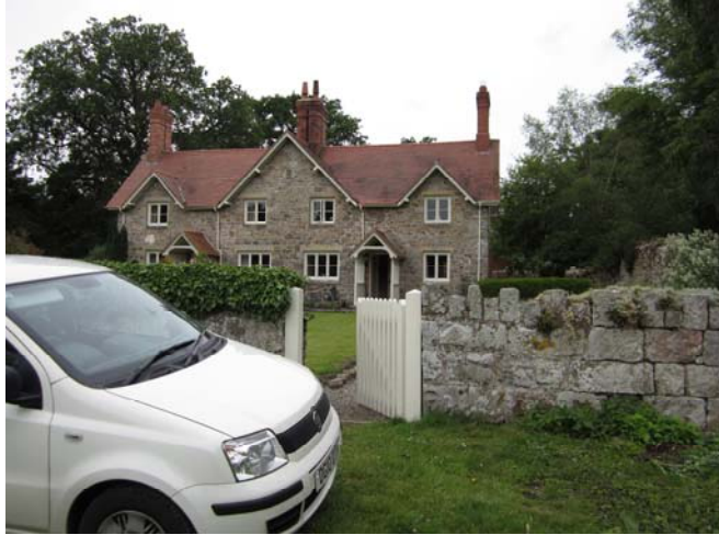
Load and Unload vehicle outside cottage

.The keysafe is in a black box outside of the front door and on the left (as facing). It is operated by a push button mechanism. A torch is recommended especially if arriving in the dark as the numbers on the box can be difficult to see. The leu os returned to the keysafe on departure.