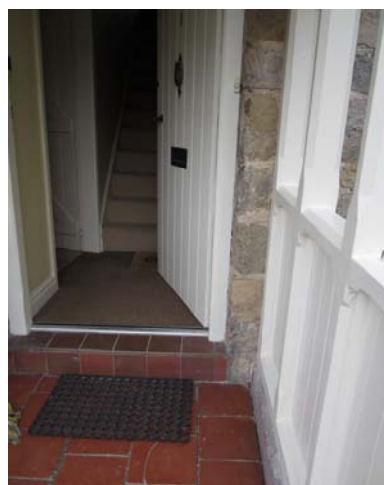
Step into cottage