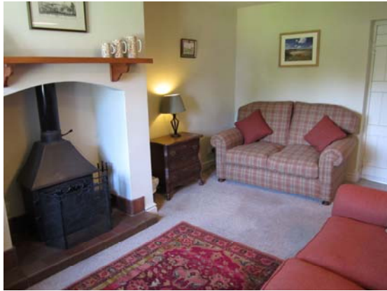
Extra lighting on side table