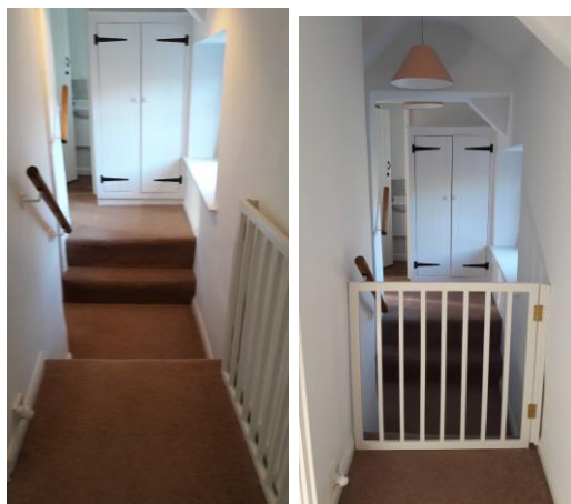
Landing towards WC