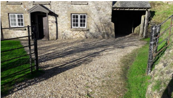
Entrance gate and parking area