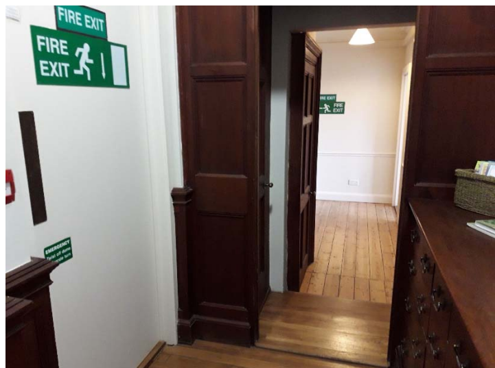
From upper hallway towards lower hall and kitchen