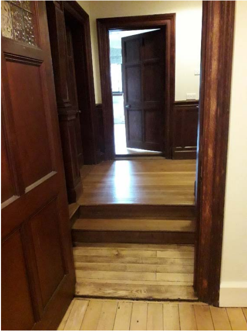
Entrance to internal lobby showing steps