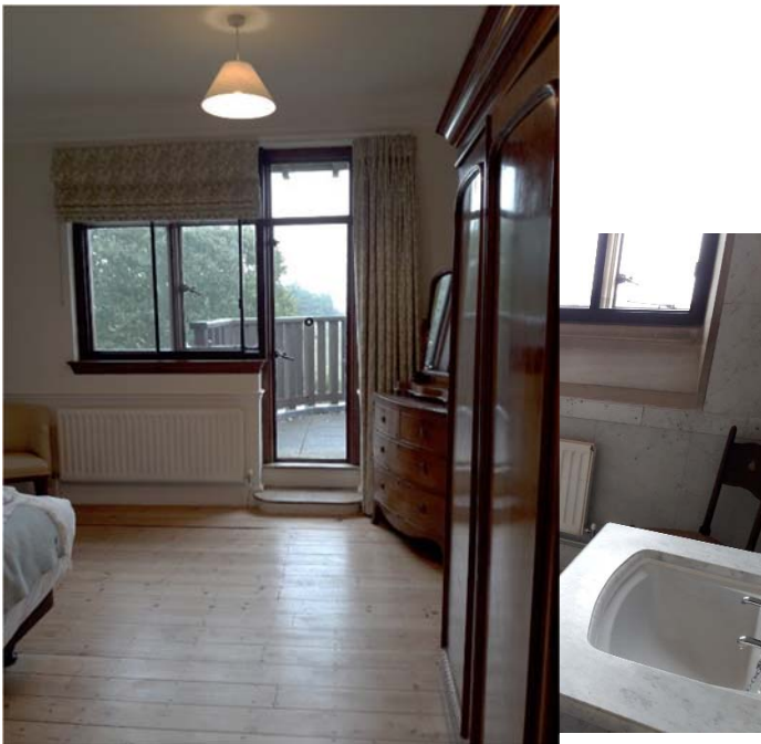
Super kingsize bedroom steps to terrace