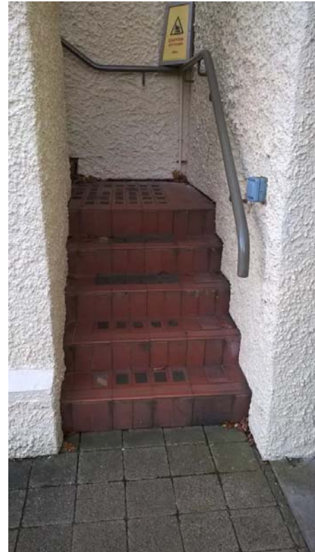
Exterior stairs up to the apartment