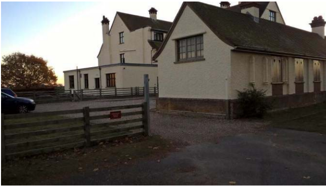
Entrance to gravel parking area by Tranmer House