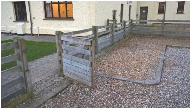
Gate from parking area to path to base of steps