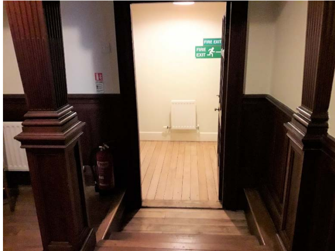
Internal lobby towards front door and external lobby showing two steps down & wooden threshold