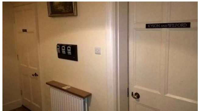
Keysafes on wall of communal first floor lobby; door to Deben View on the left